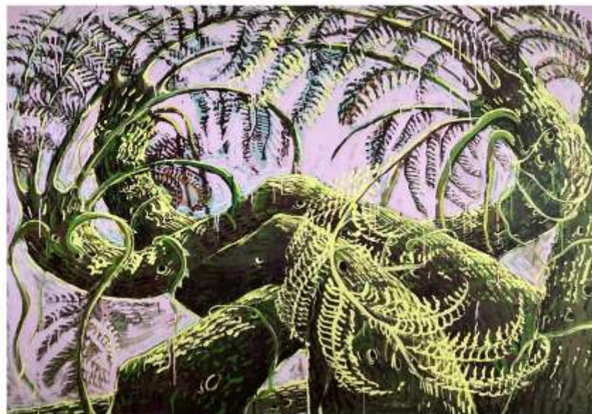
Ben Taylor, Anthropomorphic trees, 2021 Acrylic on cotton, 1220 x 1520 mm