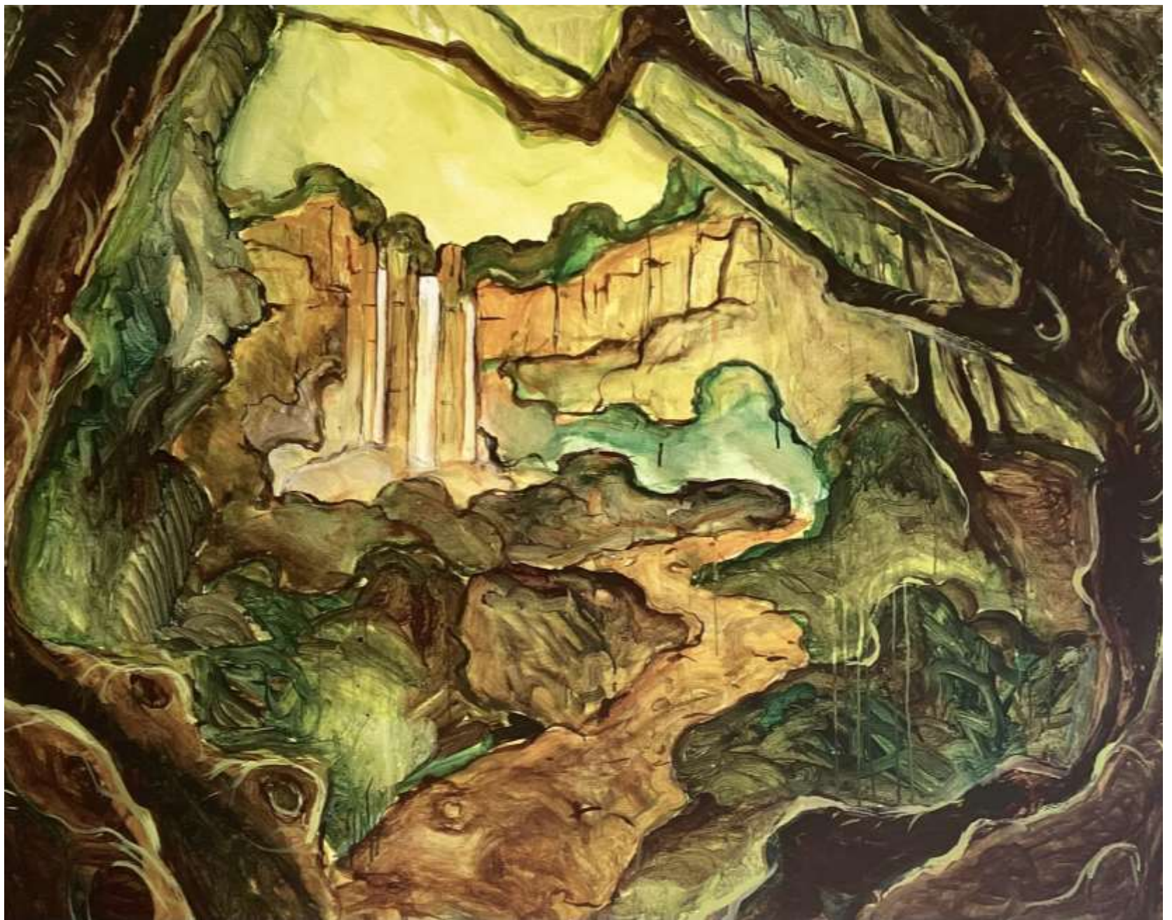
Ben Taylor, Mystical landscape . 2022 Acrylic on cotton, 122 cm x 183 cm $5,000