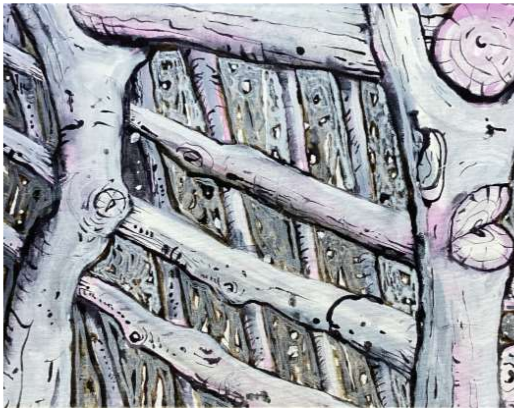
Ben Taylor, Shed . 2021 Acrylic on cotton, 31 x 41 cm $650 SOLD