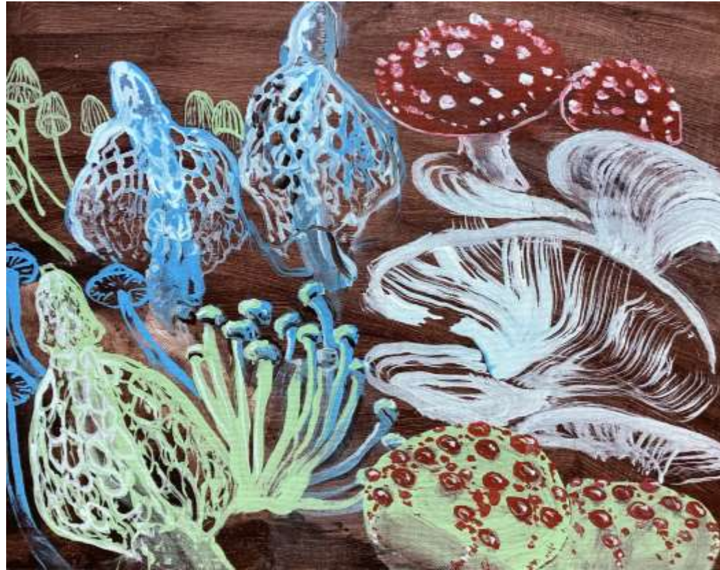
Ben Taylor, Mushroom study . 2021 Acrylic on cotton, 31 x 41 cm $650