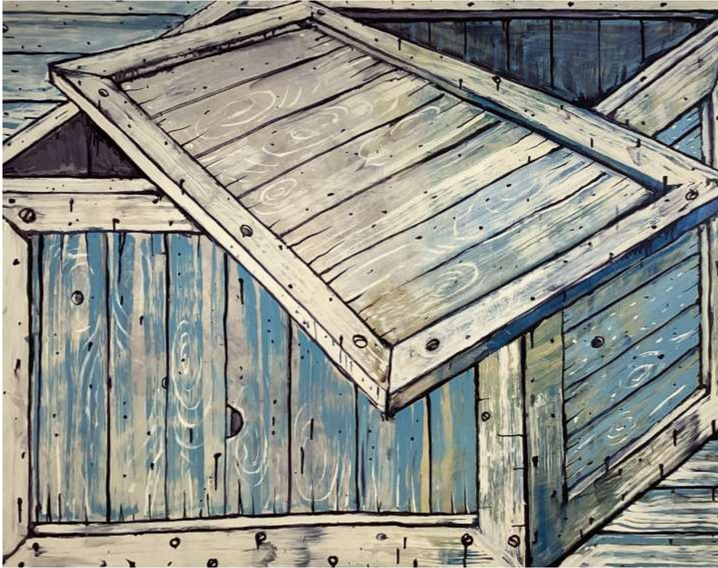
Ben Taylor, Pine box . 2020 Acrylic on cotton, 92 x 122 cm $2,500