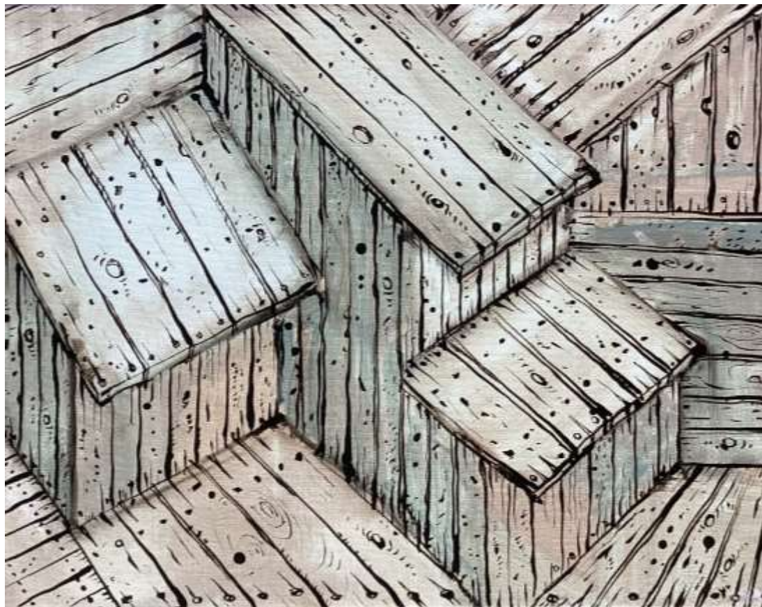
Ben Taylor, Woodshed . 2021 Acrylic on cotton, 31 x 41 cm $650 SOLD