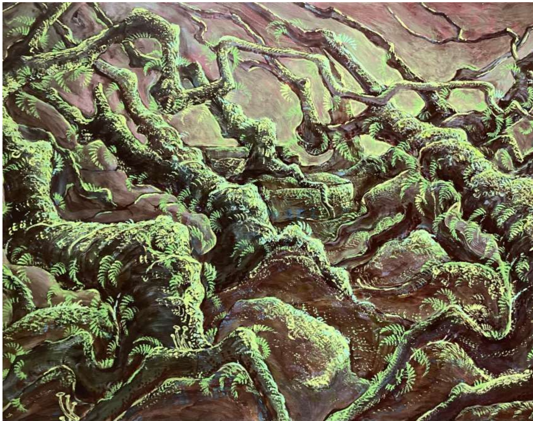
Ben Taylor, A forest . 2021 Acrylic on cotton, 122 x 183 cm $5,000