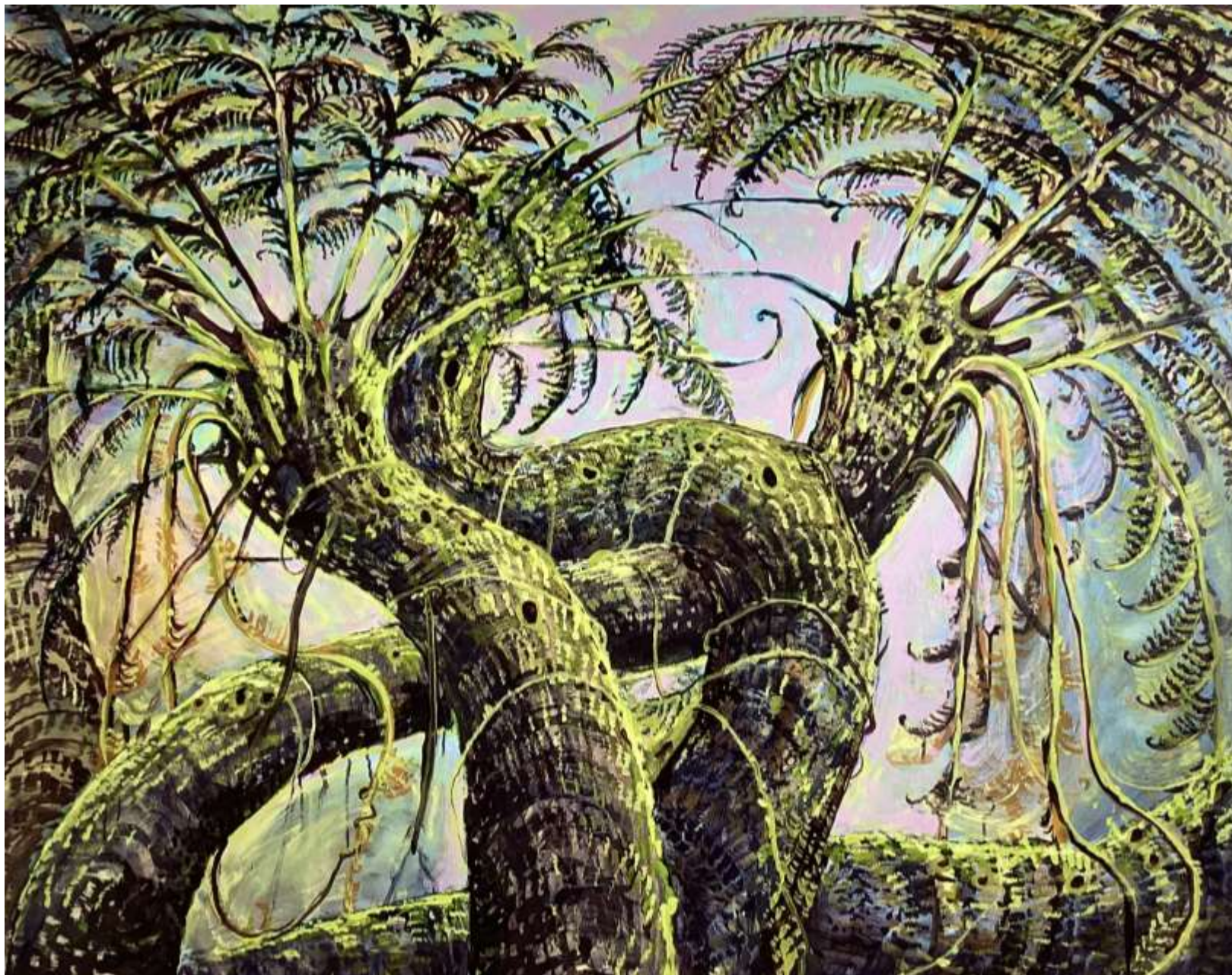
Ben Taylor, Ferns . 2021 Acrylic on cotton 122cm x 152 mm $4,500