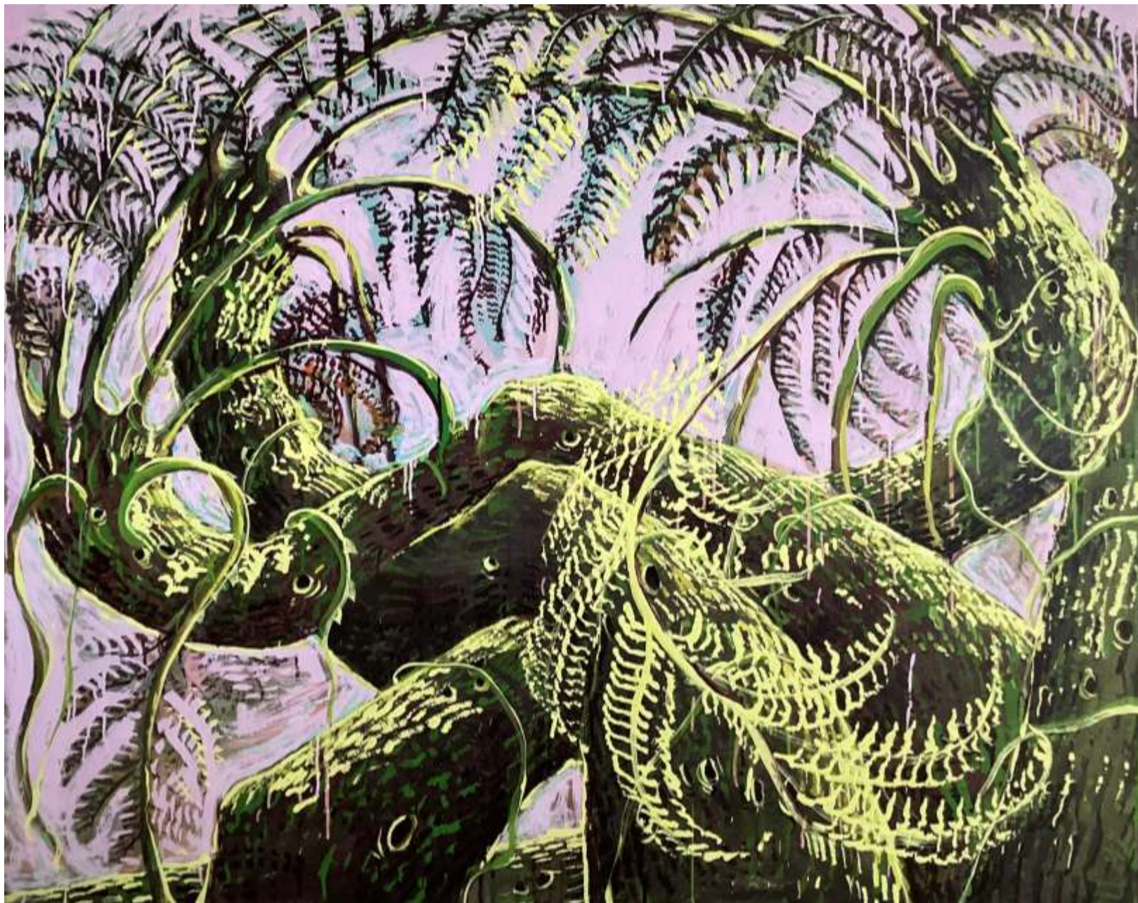
Ben Taylor, Anthropomorphic trees . 2021 Acrylic on cotton, 122 cm x 152cm $4,500