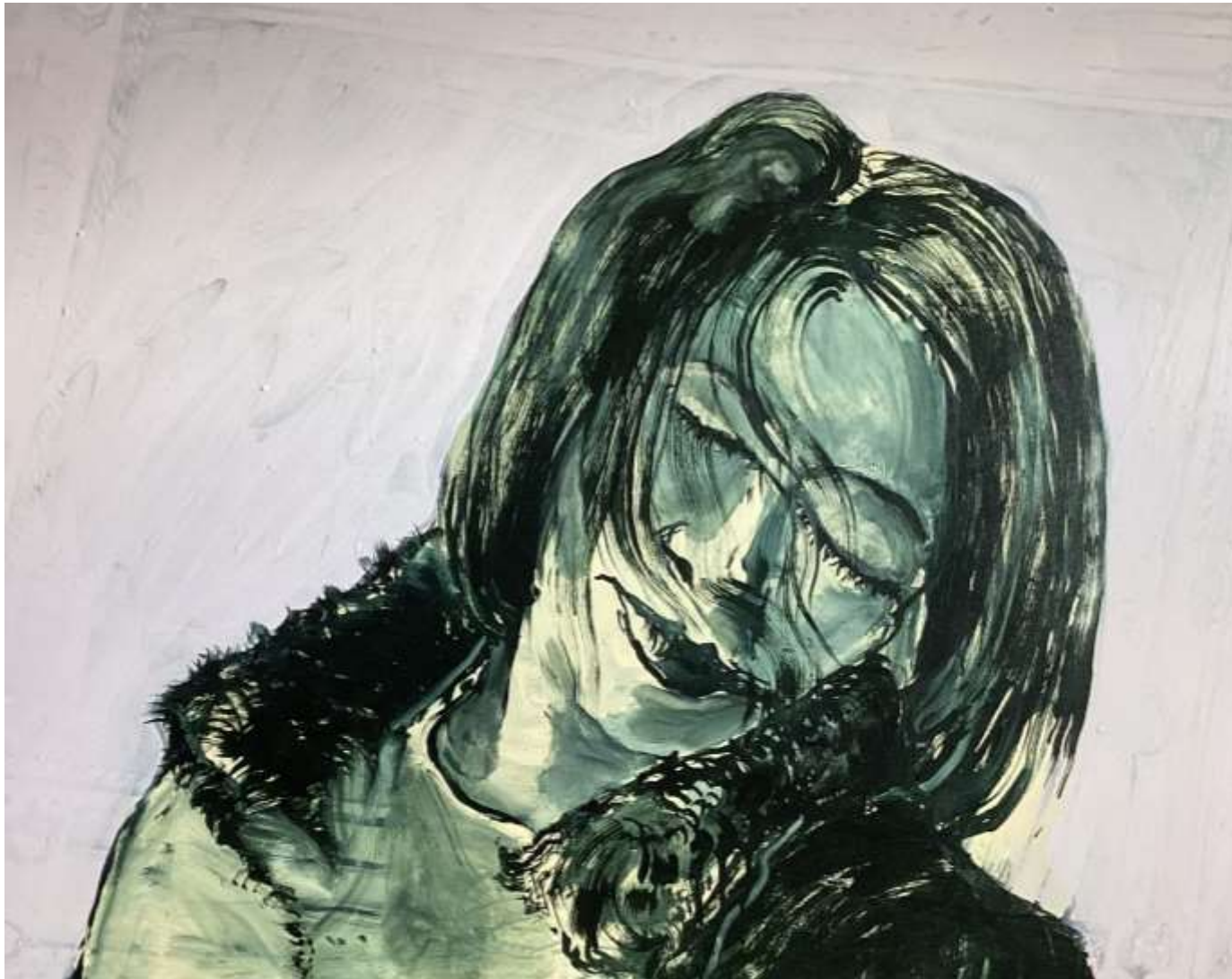
Ben Taylor, Anouk . 2020, Acrylic on cotton, 920 x 122 cm $2,500