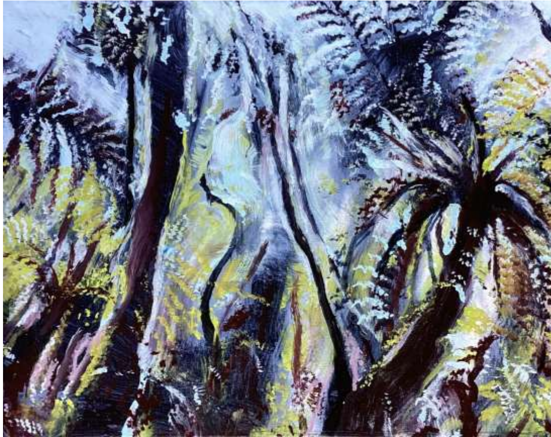
Ben Taylor, Fern study . 2022 Acrylic on cotton, 31 x 41 cm $650 SOLD