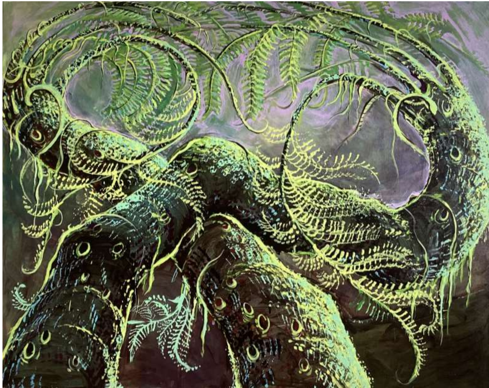
Ben Taylor, Night ferns . 2021 Acrylic on cotton 122 x 152 cm $4,500