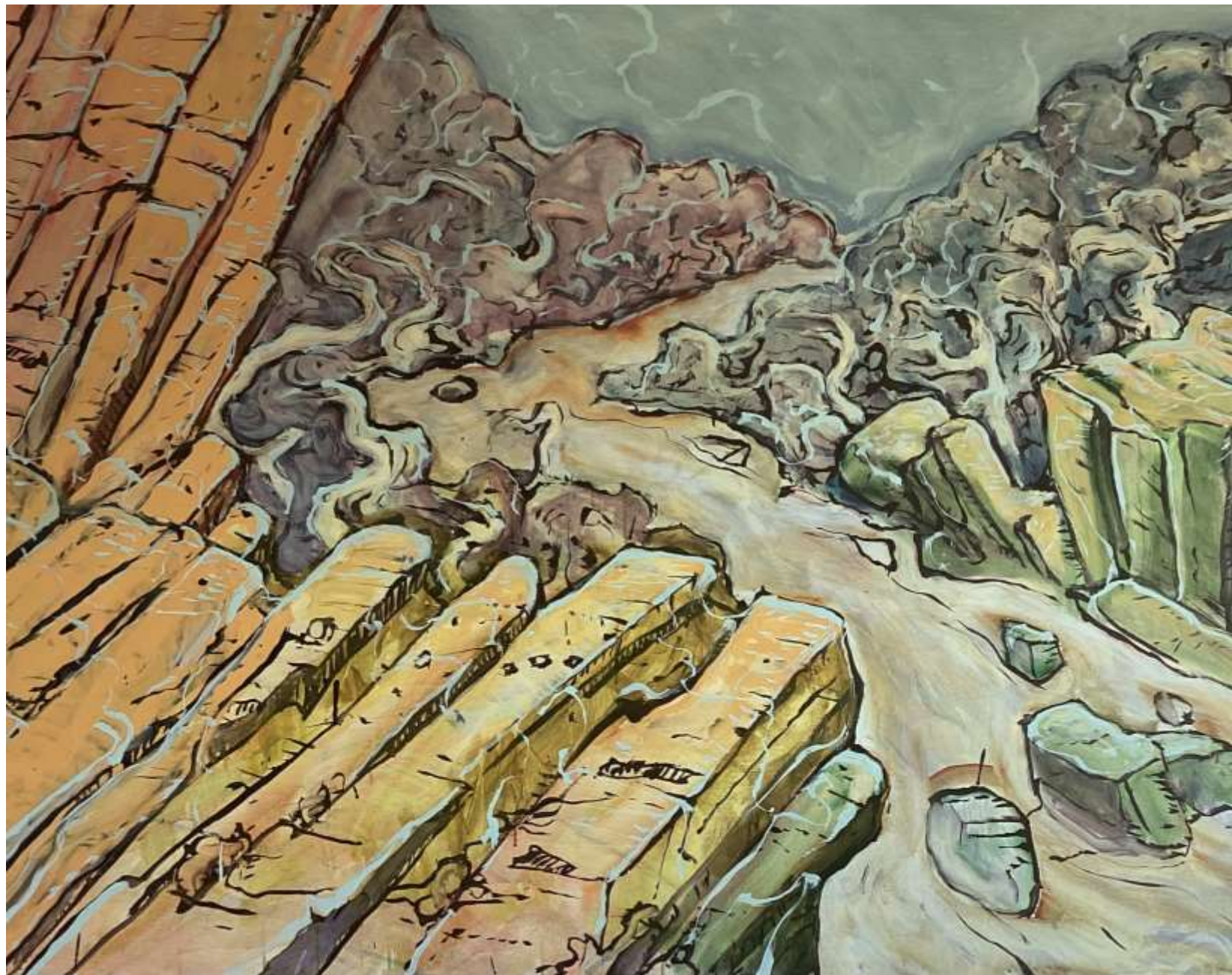
Ben Taylor, Red Rock Gorge . 2022 Acrylic on cotton 122 x 183 cm $5,000