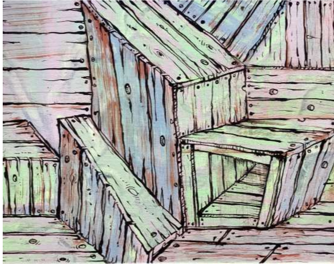
Ben Taylor, Timber forms . 2021 Acrylic on cotton, 31 x 41 cm $650