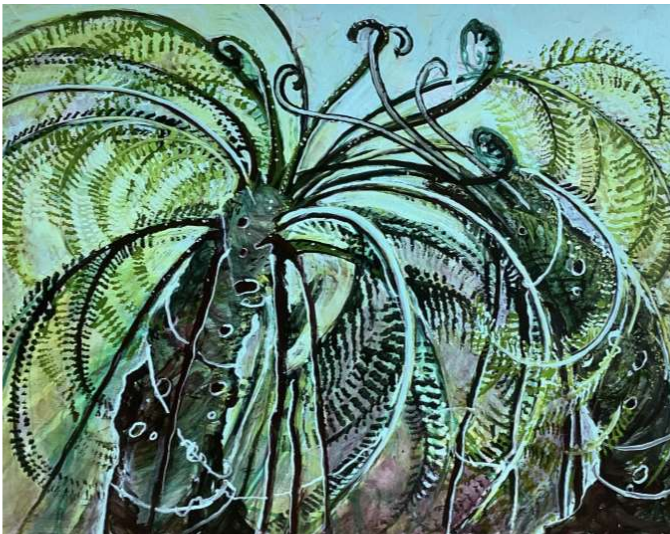
Ben Taylor, Entangled . 2022. Acrylic on cotton, 92 x 122 cm $2,500