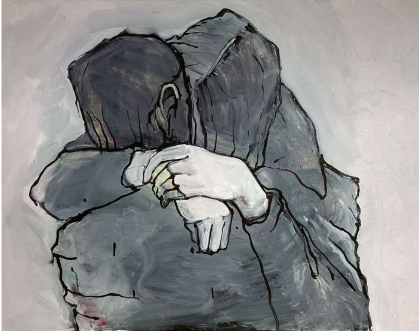
Ben Taylor, Lovers . 2020 Acrylic on cotton, 92 x 122 cm $2,500