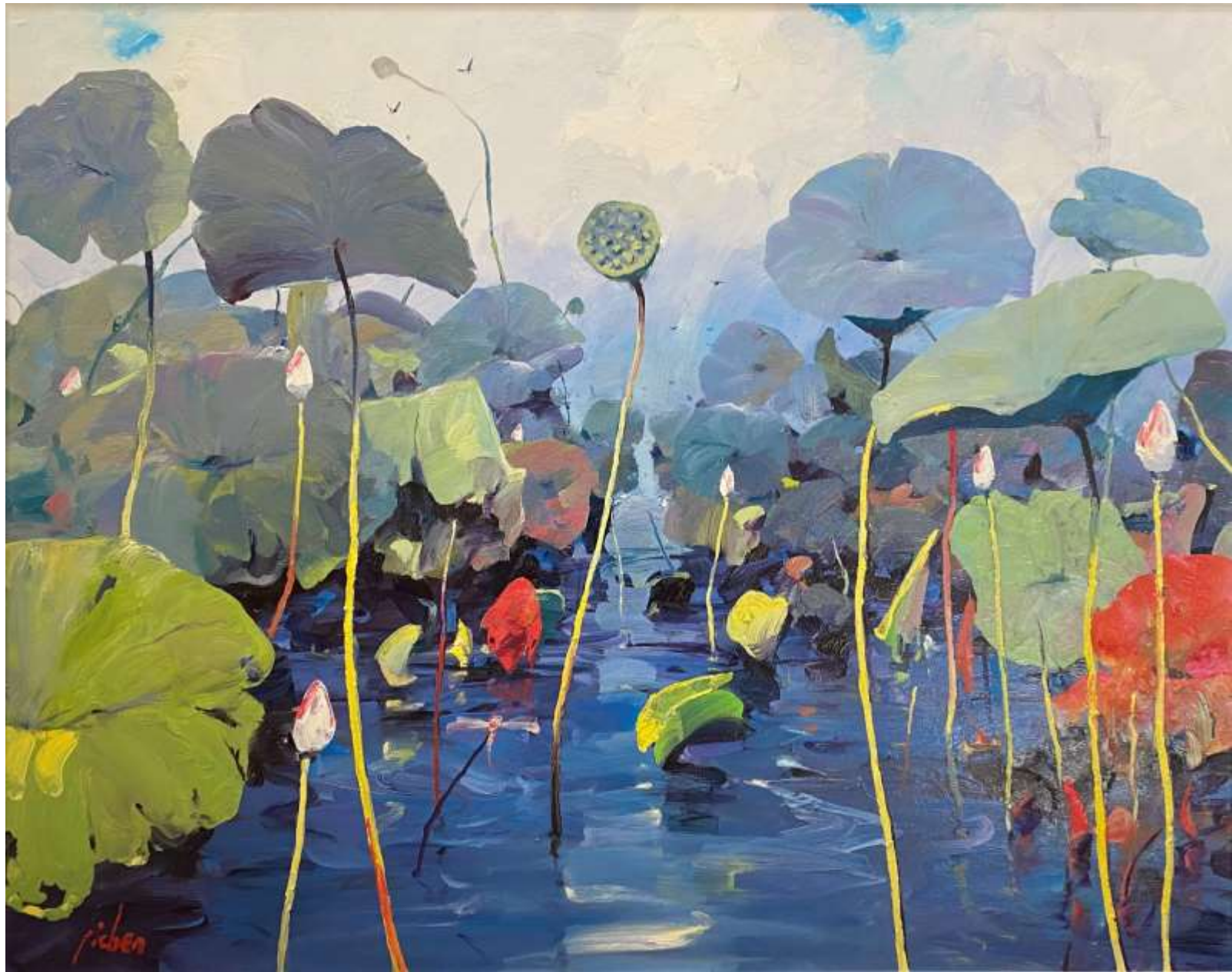
Ji Chen, Lotus Pond series II . 2023 oil on canvas 100cm x 120cm $11,500