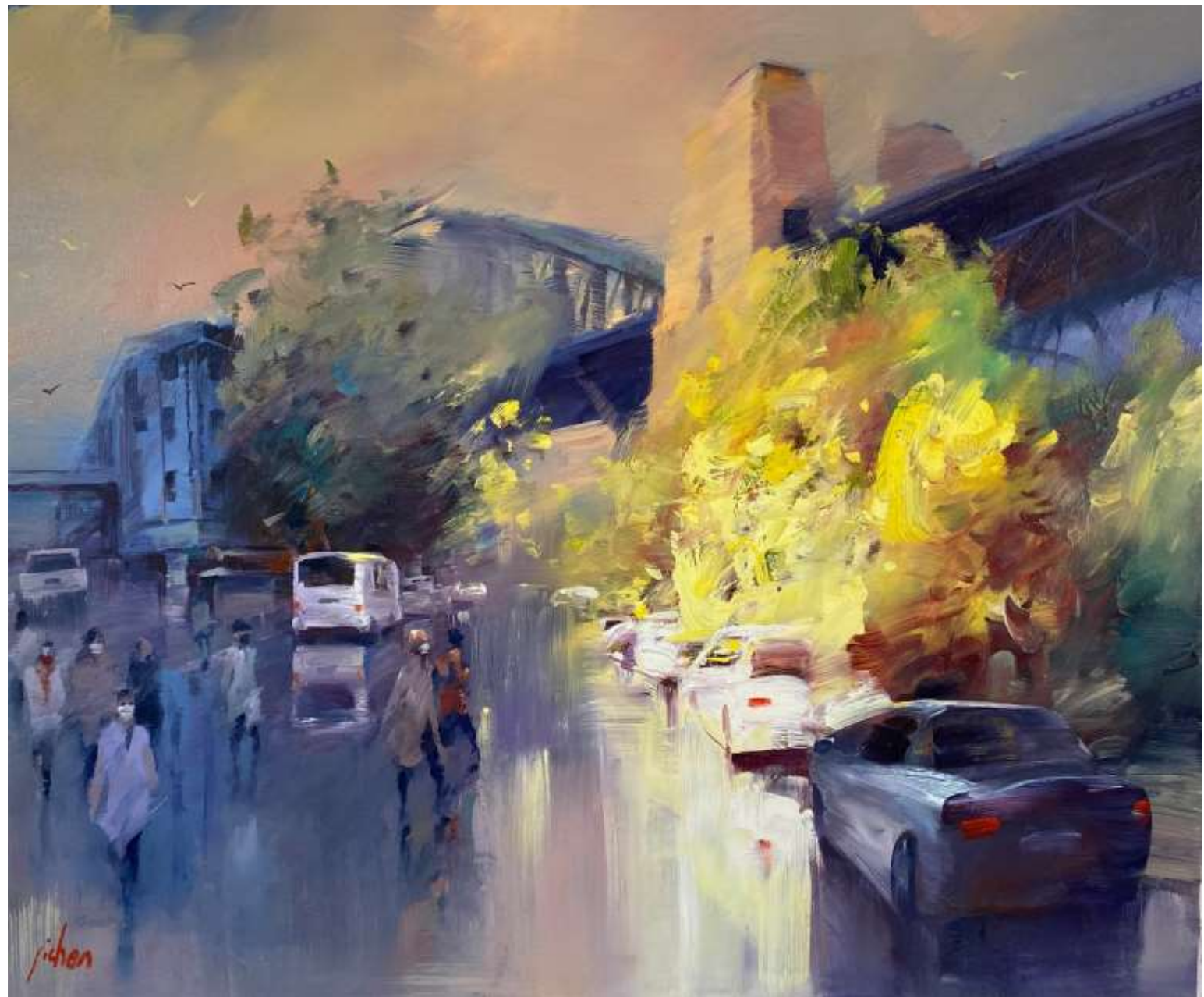
Ji Chen, Sydney Bridge II 2022 oil on canvas 100cm x 120cm $11,000