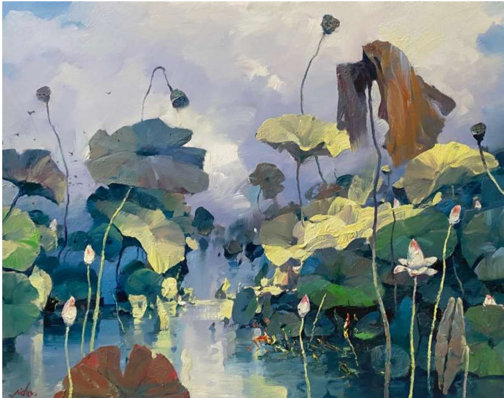
Ji Chen, Lotus Pond series IX 2021 oil on canvas 100cm x 120cm $11,000