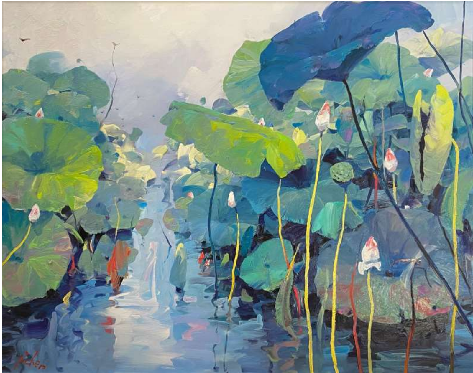
Ji Chen, Lotus Pond series III . 2023 oil on canvas 100cm x 120cm $11,500