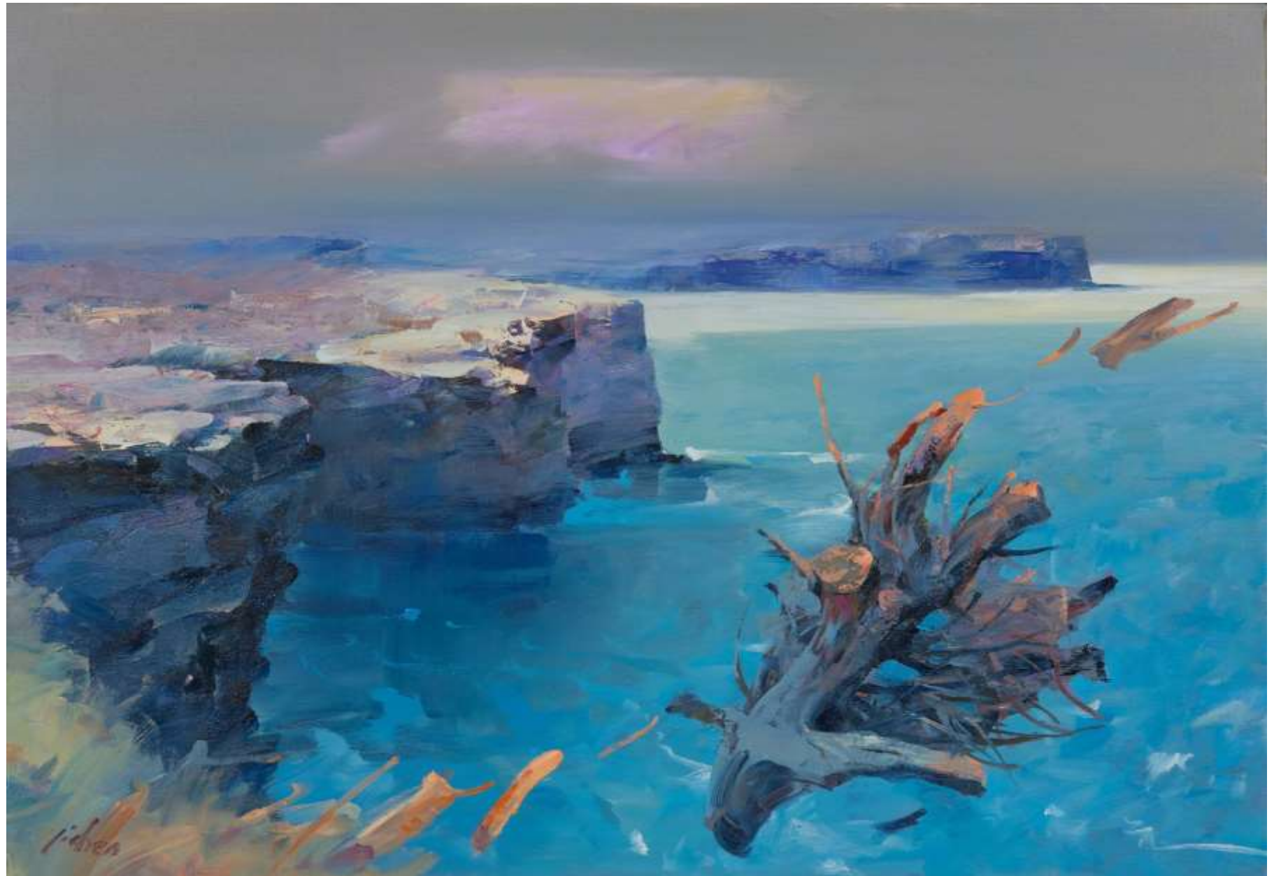
Ji Chen, Time and space, Watson Bay 2022 oil on canvas 80 cm x 100 cm $8,500