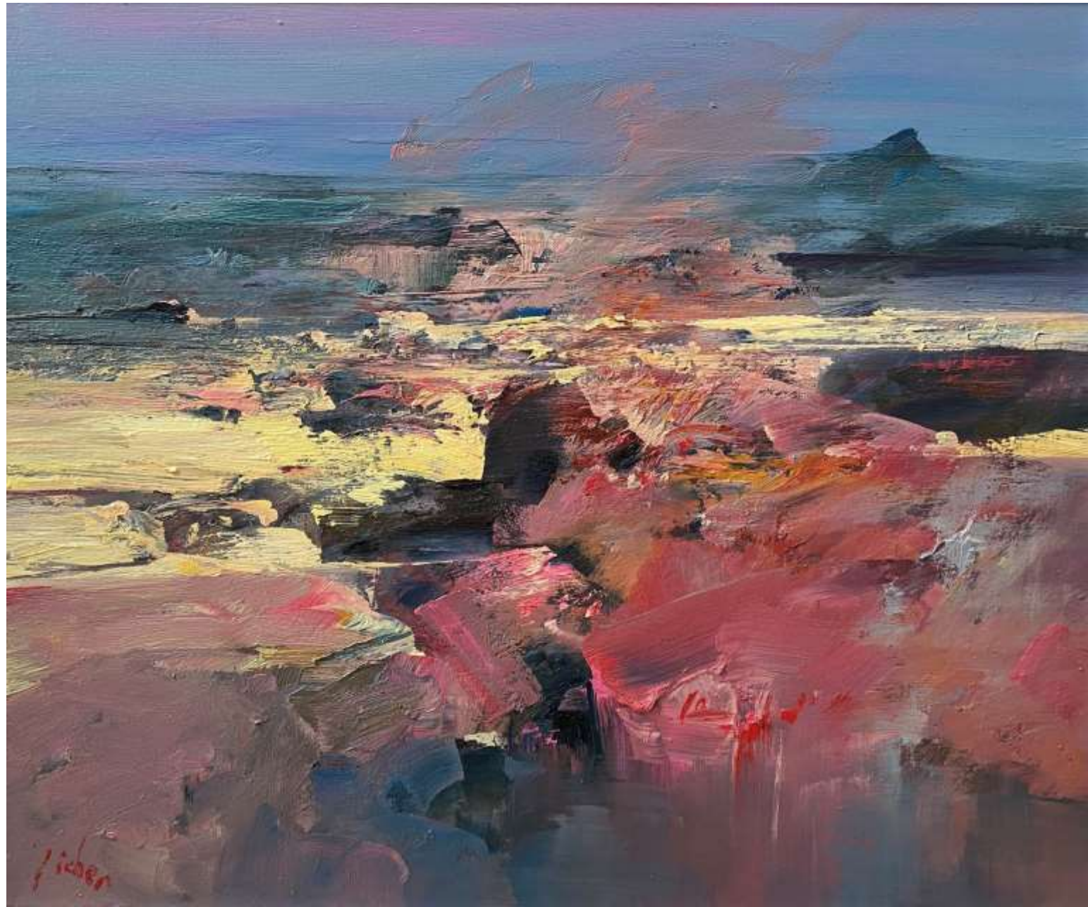
Ji Chen, Northern Desert 2022 oil on canvas 70 cm x 80 cm $5,500