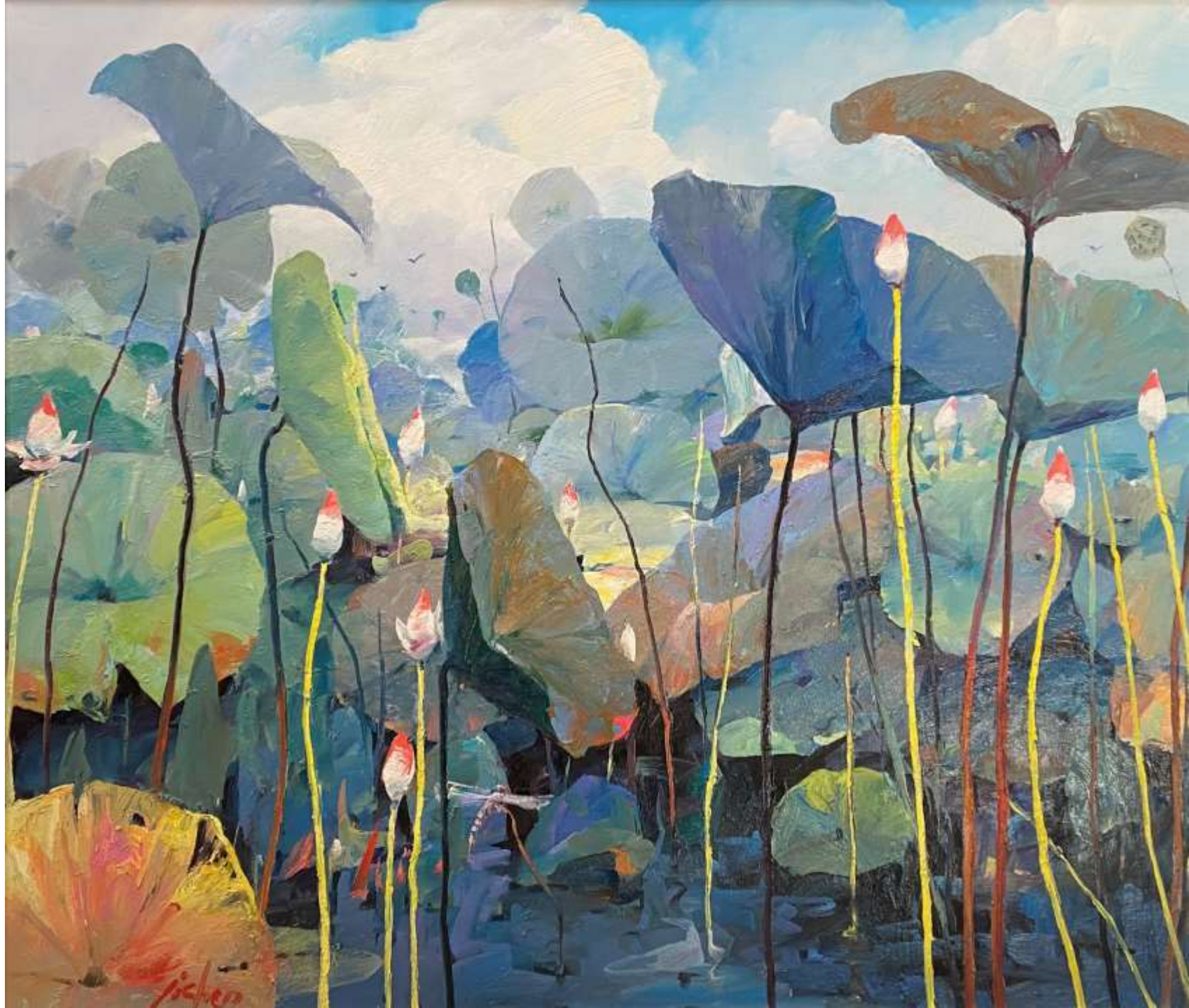
JI CHEN UNDER THE AUSTRALIAN SKY