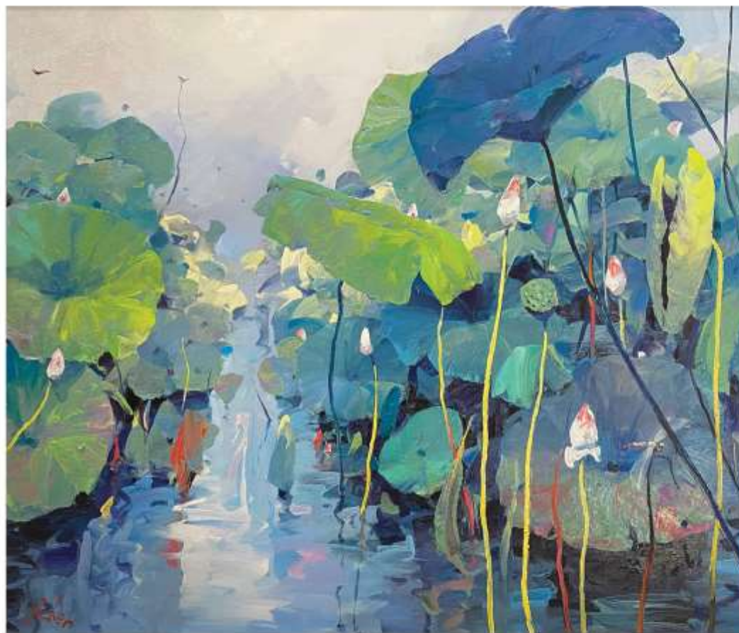
Ji Chen, Lotus series # 2 . 2023, oil on canvas. 100 x 120 cm