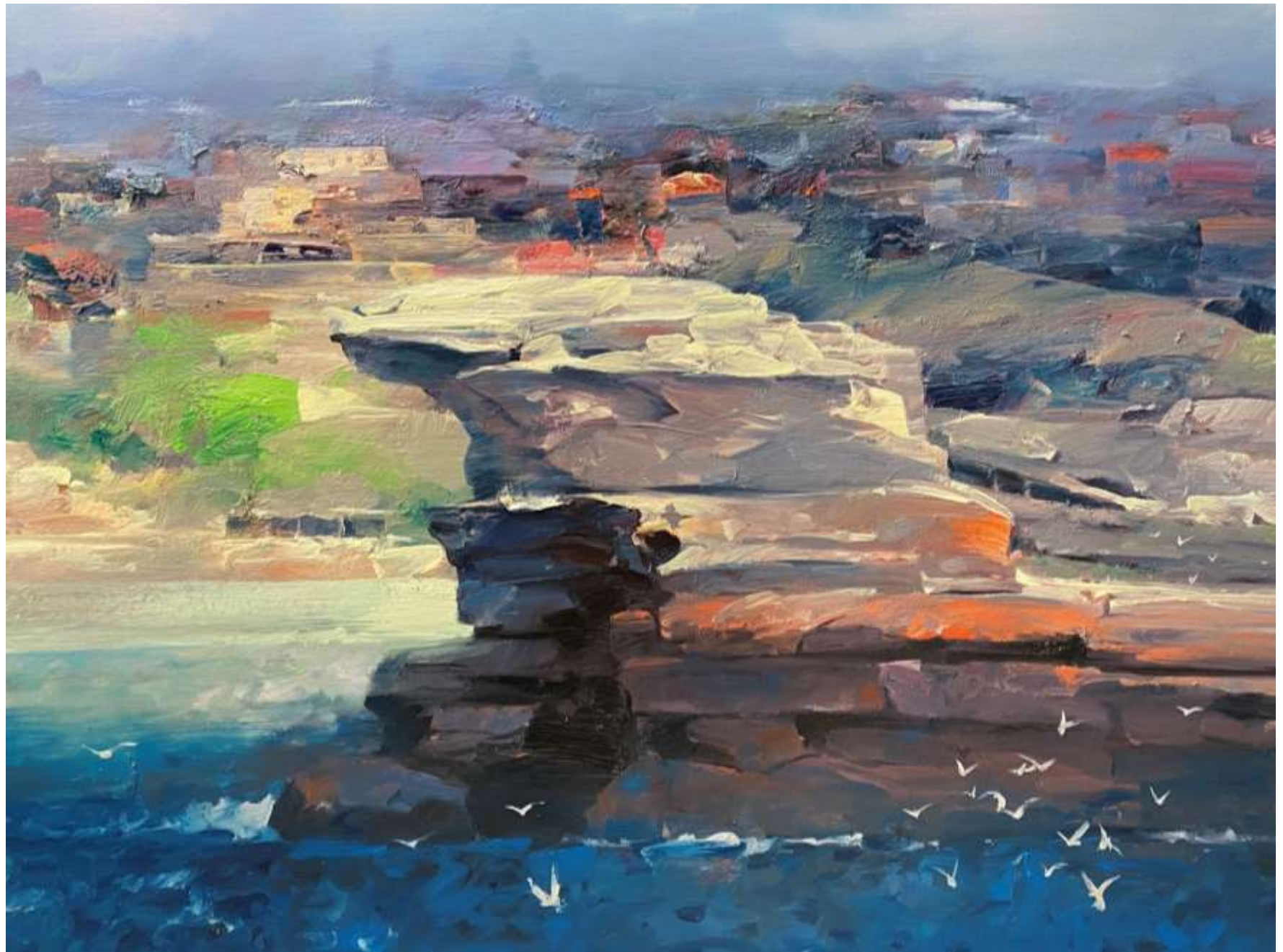
Ji Chen, In the sun 2020 oil on canvas 100 x 120 cm $11.000