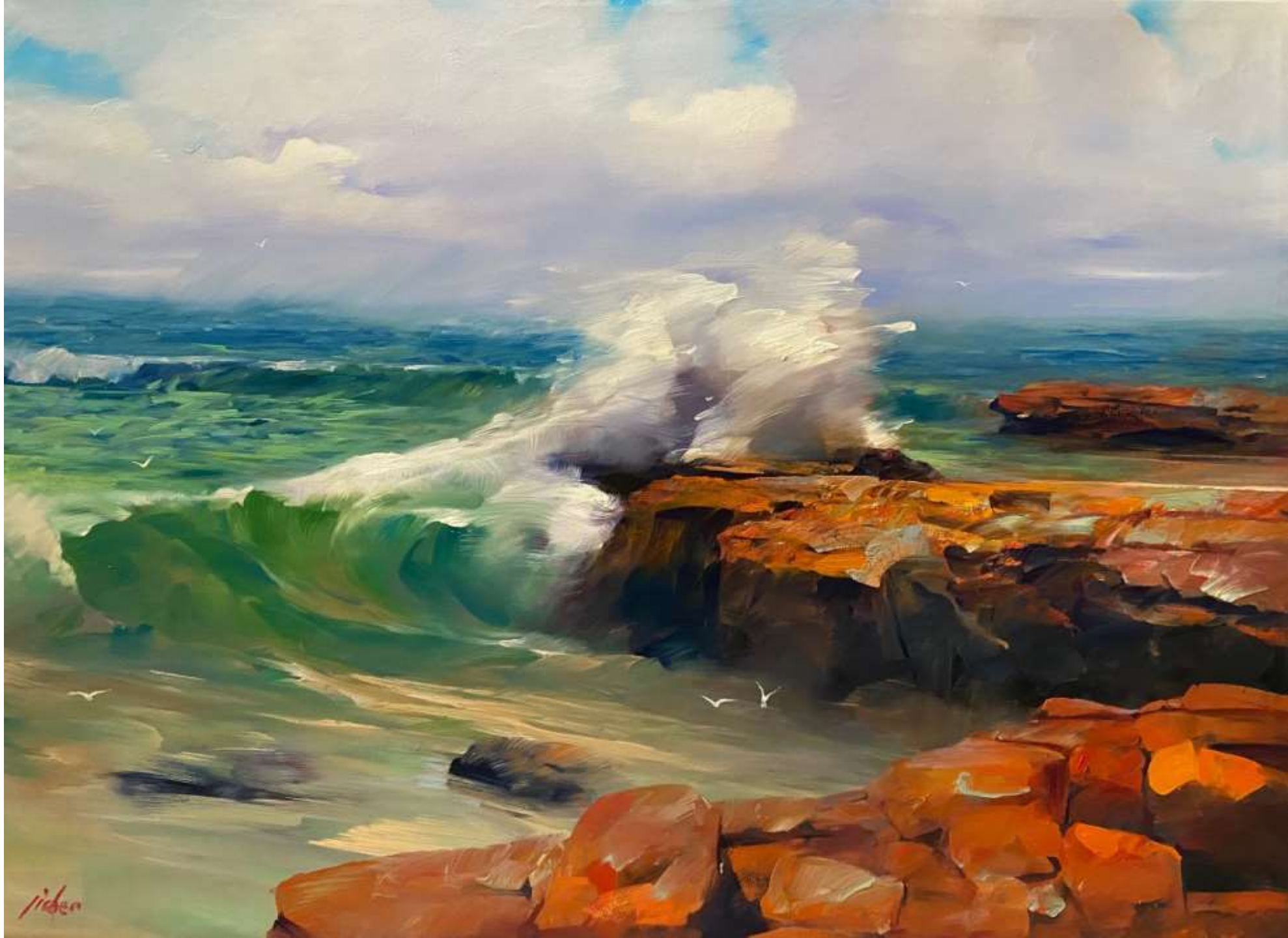
Ji Chen Big waves. 2021 oil on canvas 136 cm x 180cm $18,500