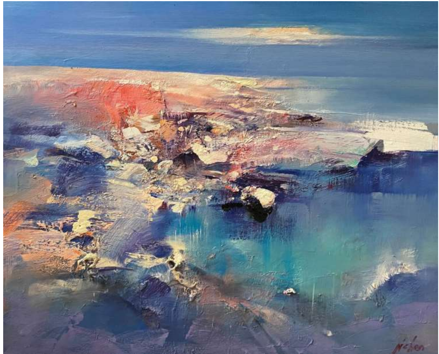
Ji Chen, Seaside meditation 2020 oil on canvas 70cm x 80cm $5,500