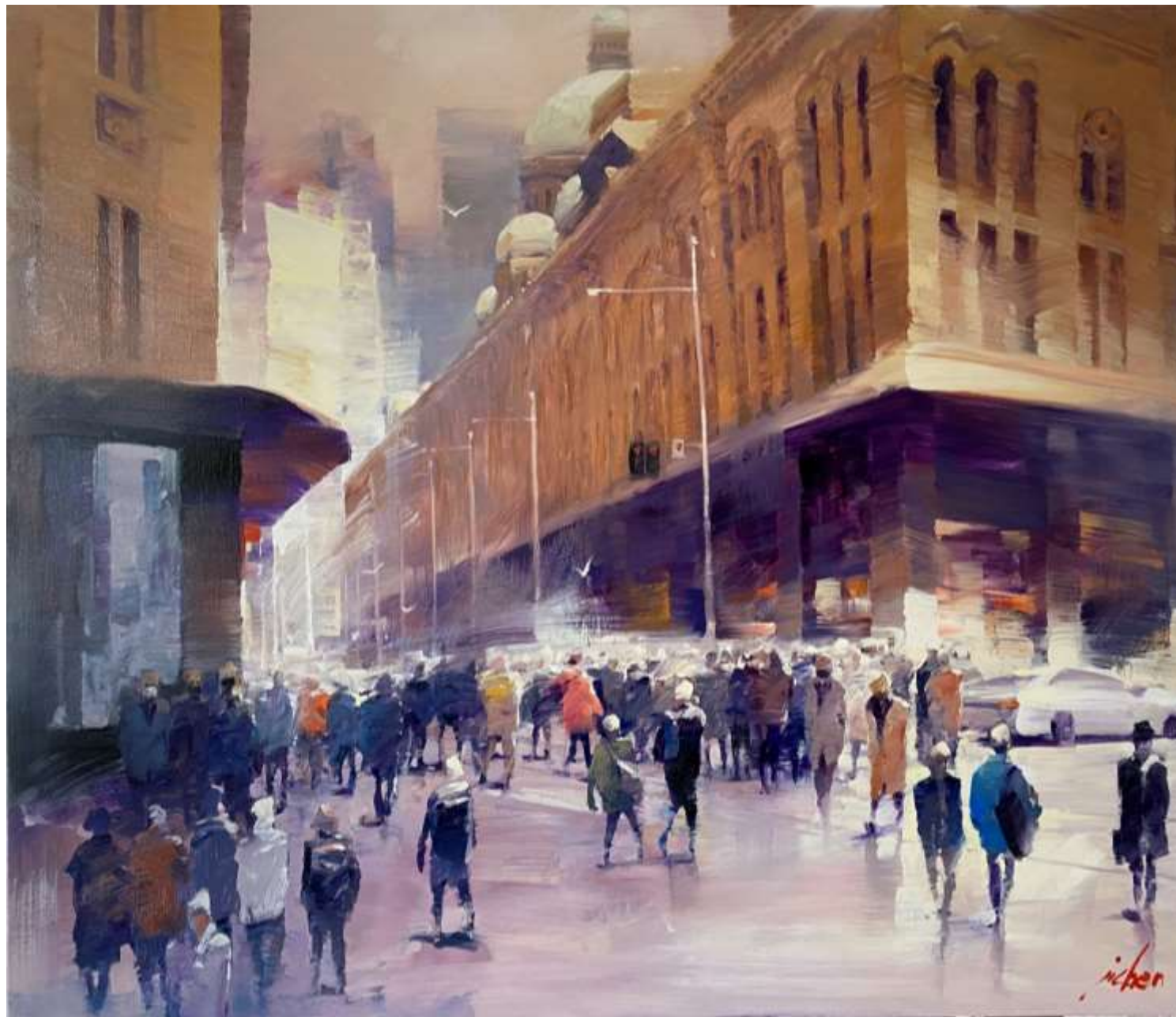
Ji Chen, George Street 2022 oil on canvas 100cm x 120cm $11,000