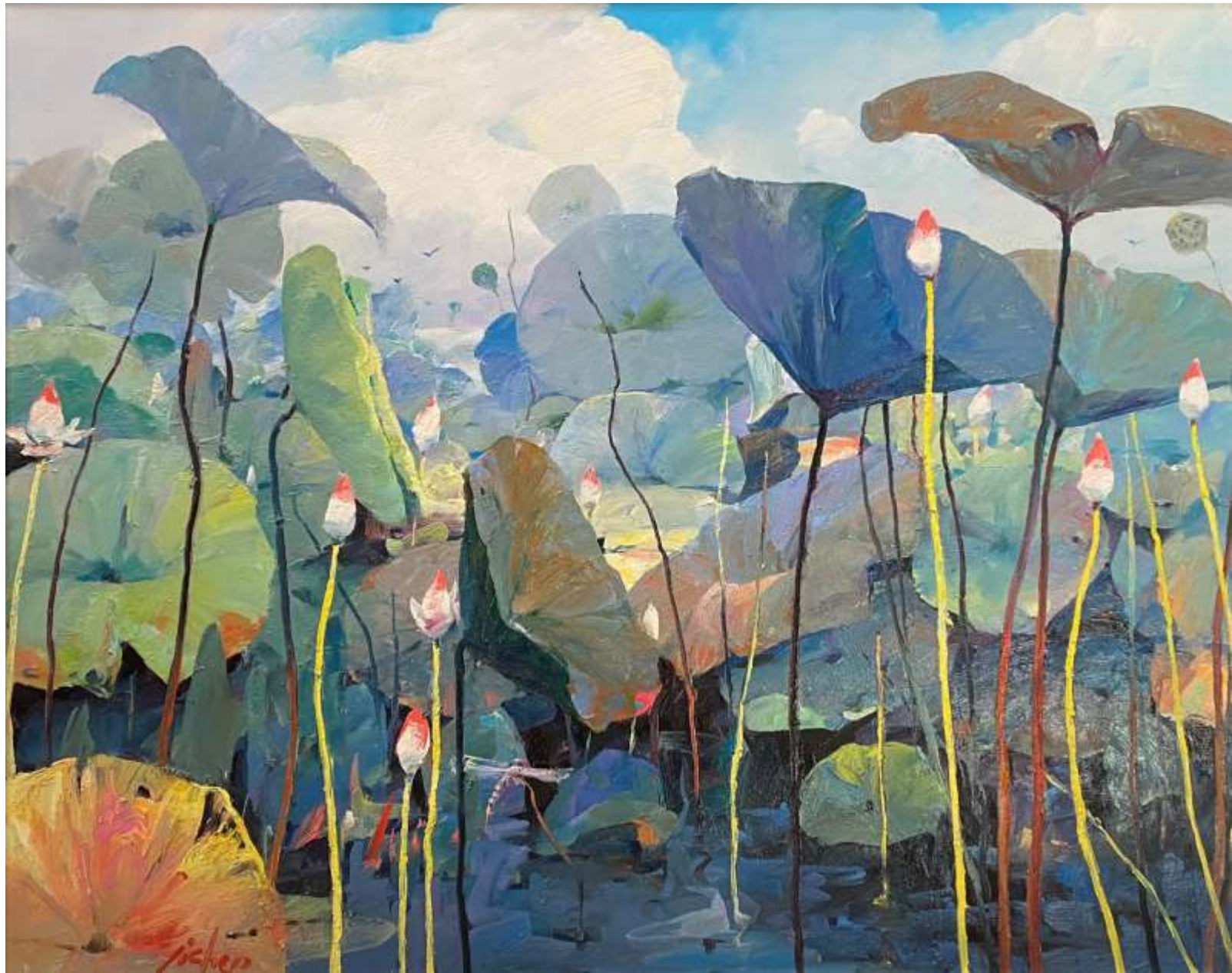
Ji Chen, Lotus Pond series IV . 2023 oil on canvas 100cm x 120cm $11,500