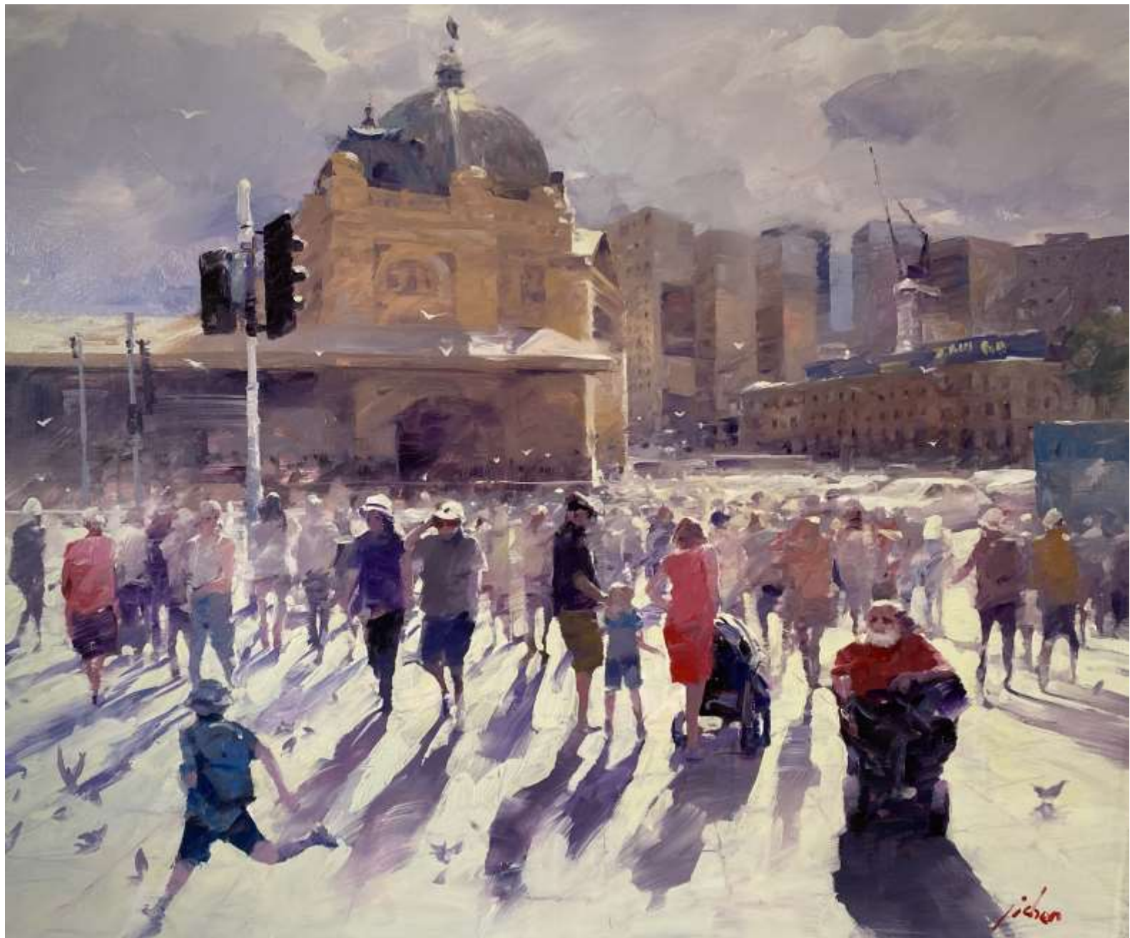
Ji Chen, Flinders Station 2022 oil on canvas 100cm x 120cm $11,000