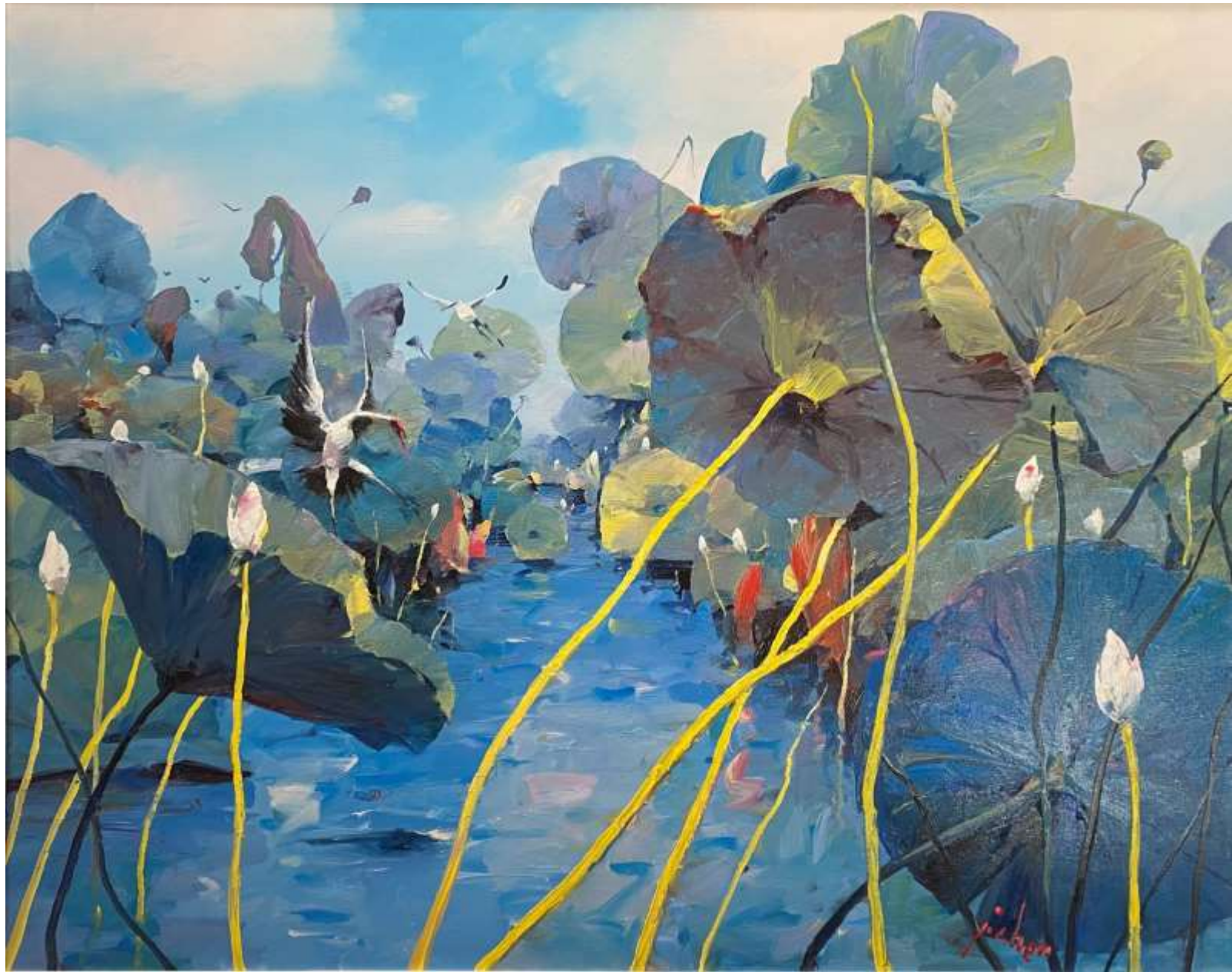
Ji Chen, Lotus Pond series I . 2023 oil on canvas 100cm x 120cm $11,500