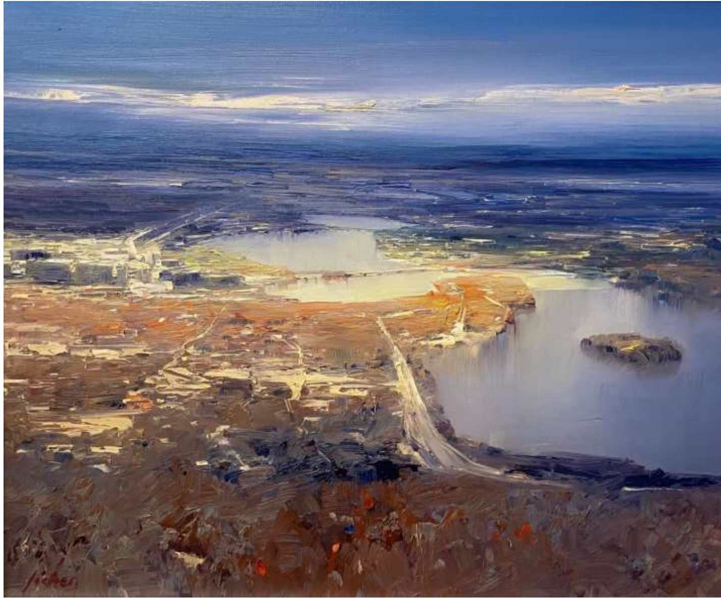
Ji Chen, View from Black Mountain, Canberra . 2019 oil on canvas 60 x 90 cm $5,500