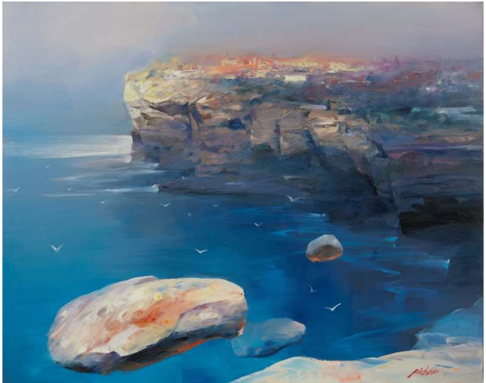
Ji Chen, Time and space, The Gap 2022 oil on canvas 80cm x 100 cm $8,500