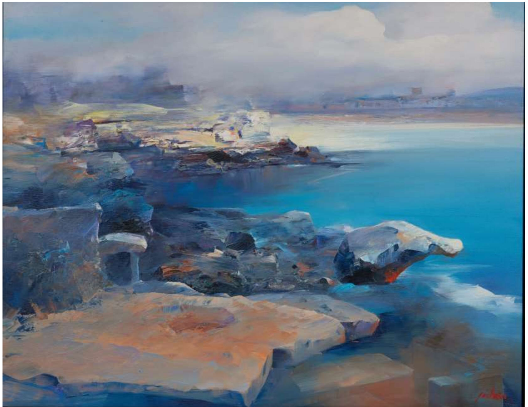
Ji Chen, Time and space, Bondi 2022 oil on canvas 90 cm x 110 cm $9,500