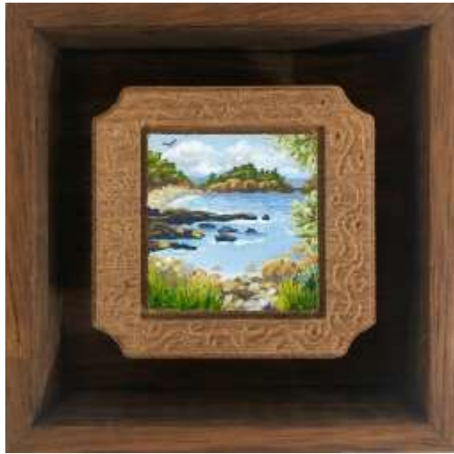
Mimosa unscathed IV 2022 Gouache and wax on wood 9 x 9 cm