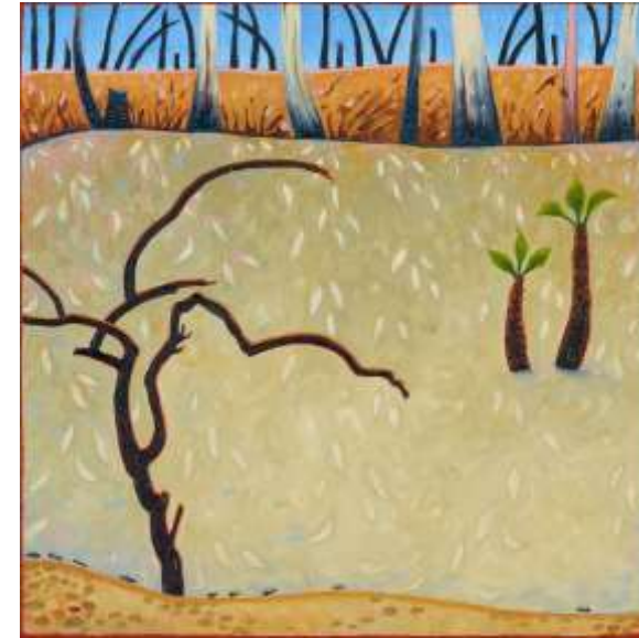
Afterstory VI Rainforest Creek 2021 Acrylic and oil on board 20 x 20cm