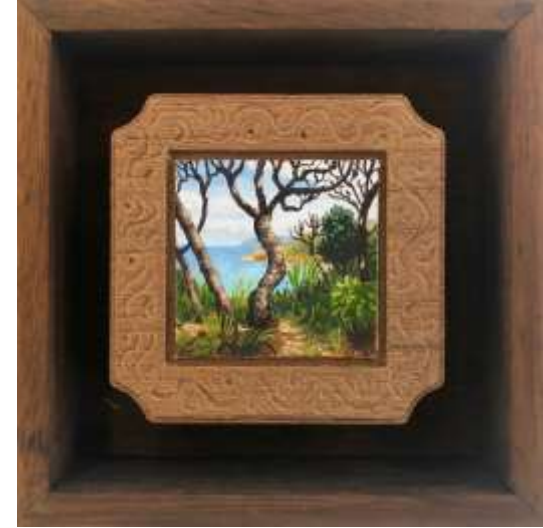
Mimosa unscathed IX 2022 Gouache and wax on wood 9 x 9 cm