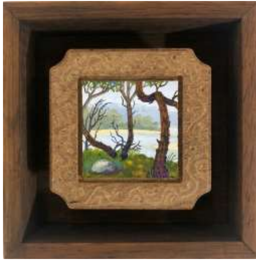
Mimosa unscathed I 2022 Gouache and wax on wood 9 x 9 cm