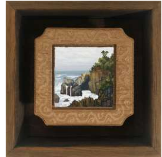
Mimosa unscathed III 2022 Gouache and wax on wood 9 x 9 cm