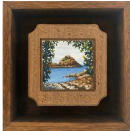
Mimosa unscathed V 2022 Gouache and wax on wood 9 x 9 cm