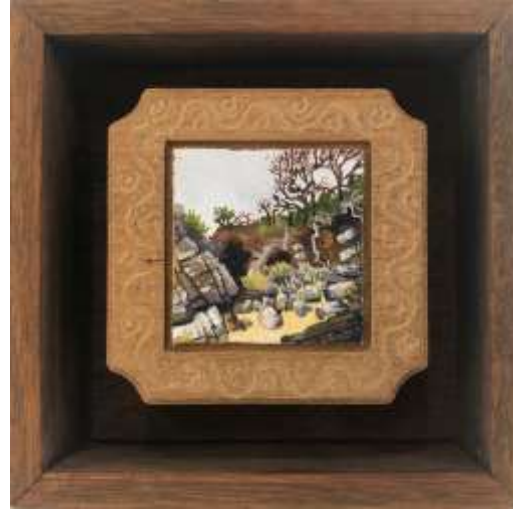
Mimosa unscathed V III 2022 Gouache and wax on wood 9 x 9 cm