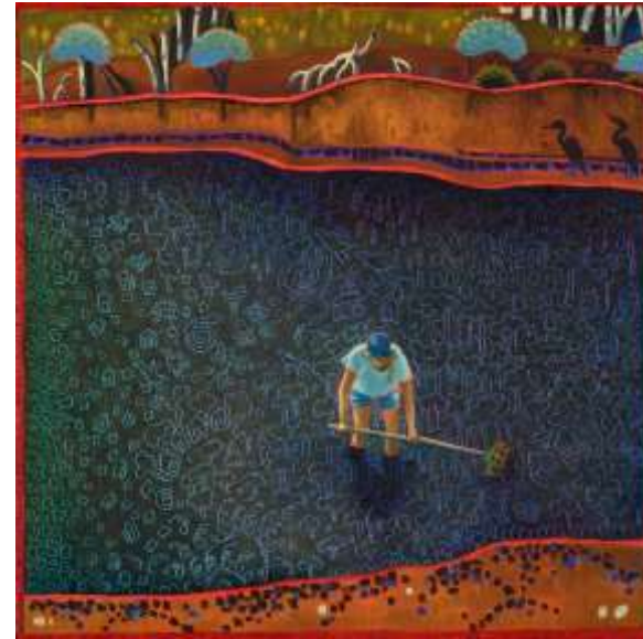
Afterstory III Orange lake 2021 Acrylic and oil on board 20 x 20cm