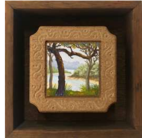
Mimosa unscathed VI 2022 Gouache and wax on wood 9 x 9 cm