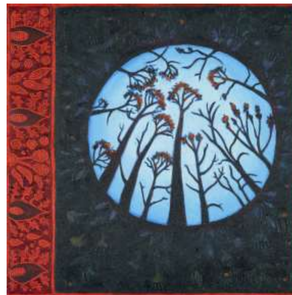
Afterstory X Forest bones 2021 Acrylic and oil on board 20 x 20cm