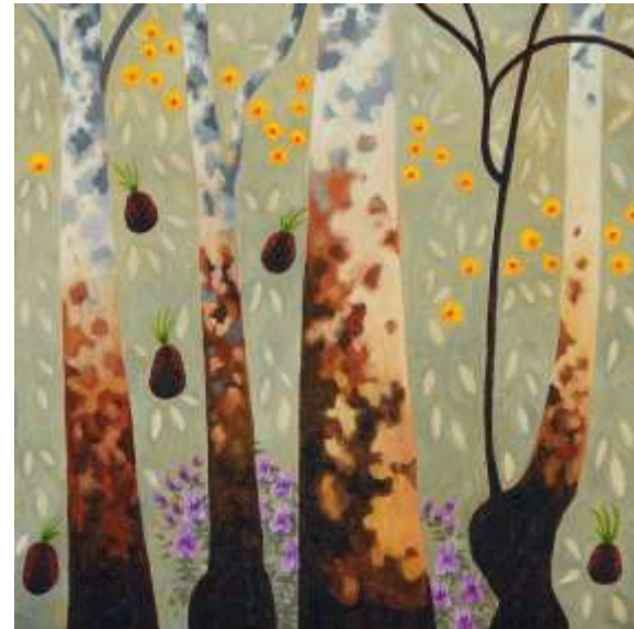
Afterstory XVI On the fringe of the flame 2021 Acrylic and oil on board 20 x 20cm