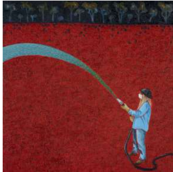
Afterstory II Raking the Bay 2021 Acrylic and oil on board 20 x 20cm