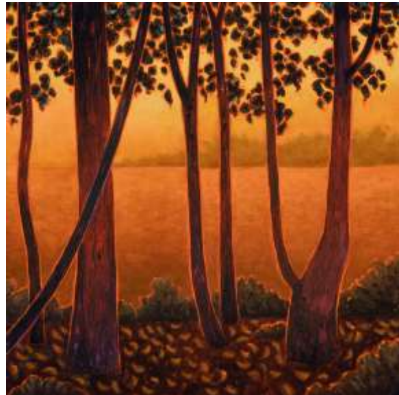
Afterstory IV Amongst the rubble. 2021 Acrylic and oil on board 20 x 20cm