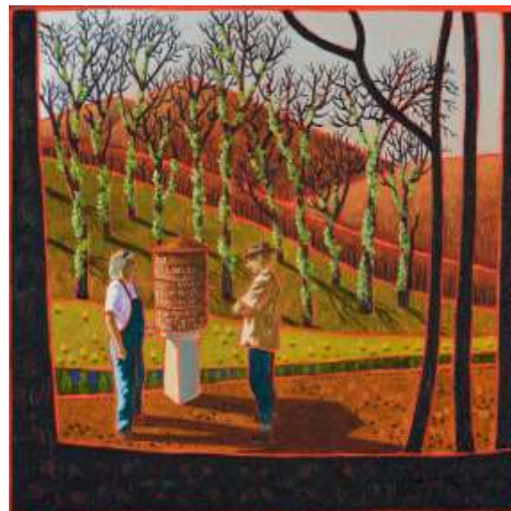
Afterstory XII The prayer wheel 2021 Acrylic and oil on board 20 x 20cm