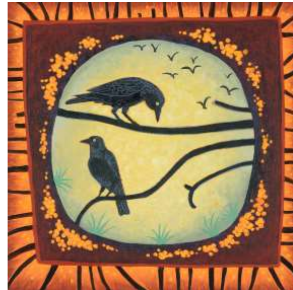
Afterstory VIII Birdlife 2021 Acrylic and oil on board 20 x 20cm