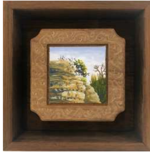
Mimosa unscathed II 2022 Gouache and wax on wood 9 x 9 cm