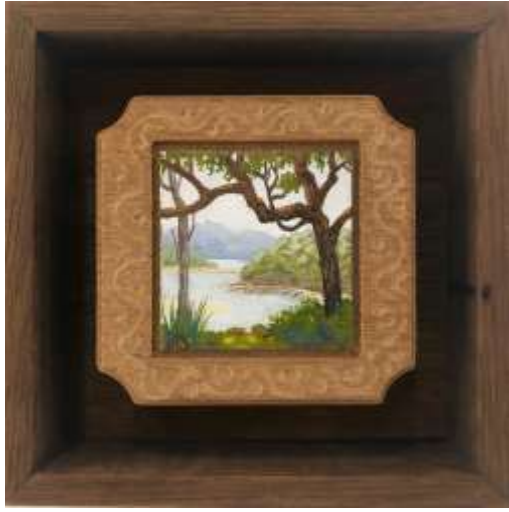
Mimosa unscathed VII 2022 Gouache and wax on wood 9 x 9 cm