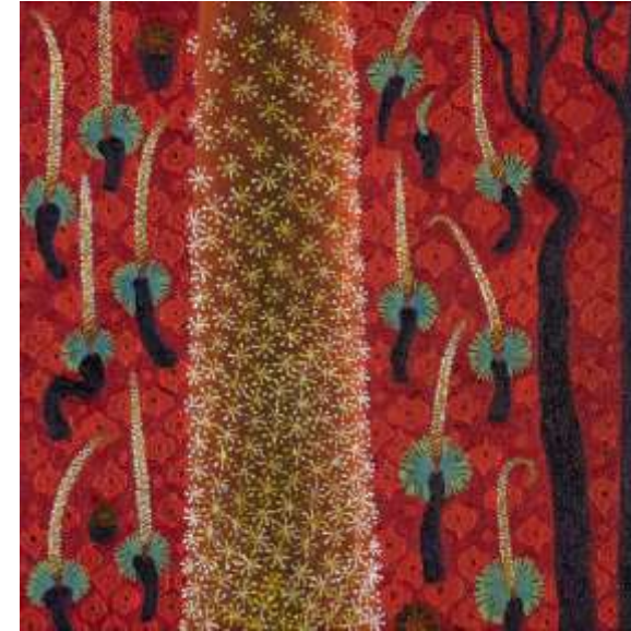
Afterstory XIV Masterpieces from the furnace 2021 Acrylic and oil on board 20 x 20cm