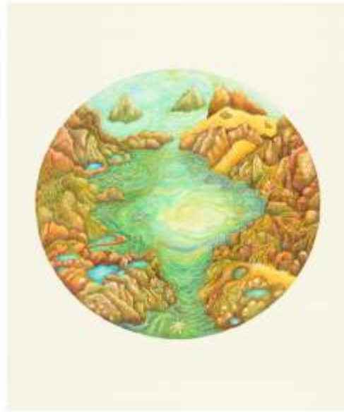
Gordon Robinson, Rockpool . 2021 mixed media on paper 43 cm dia