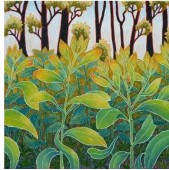
Afterstory XVIII Too dense regrowth 2021 Acrylic and oil on board 20 x 20cm