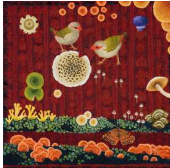
Afterstory XX Recovery team 2021 Acrylic and oil on board 20 x 20cm