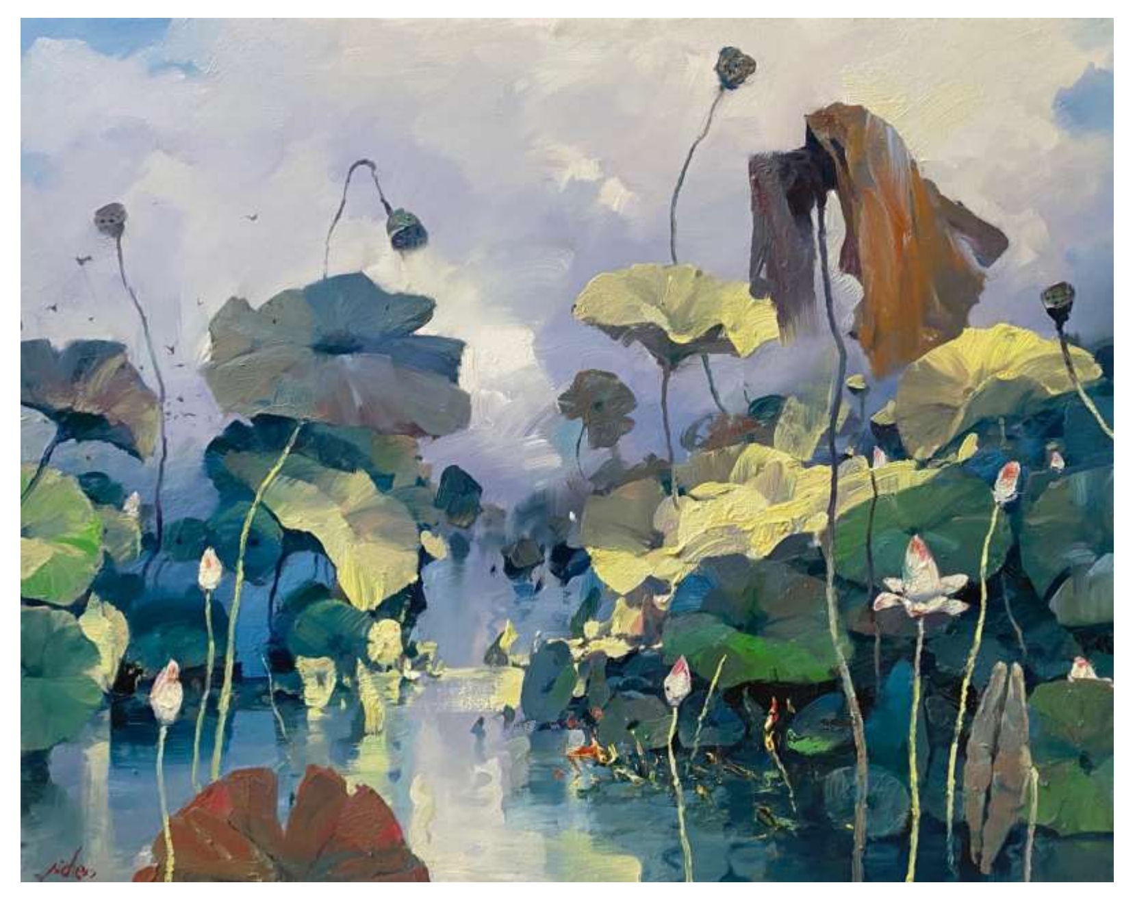
Ji Chen, Lotus Pond series IX 2021 oil on canvas 100cm x 120cm $11,000