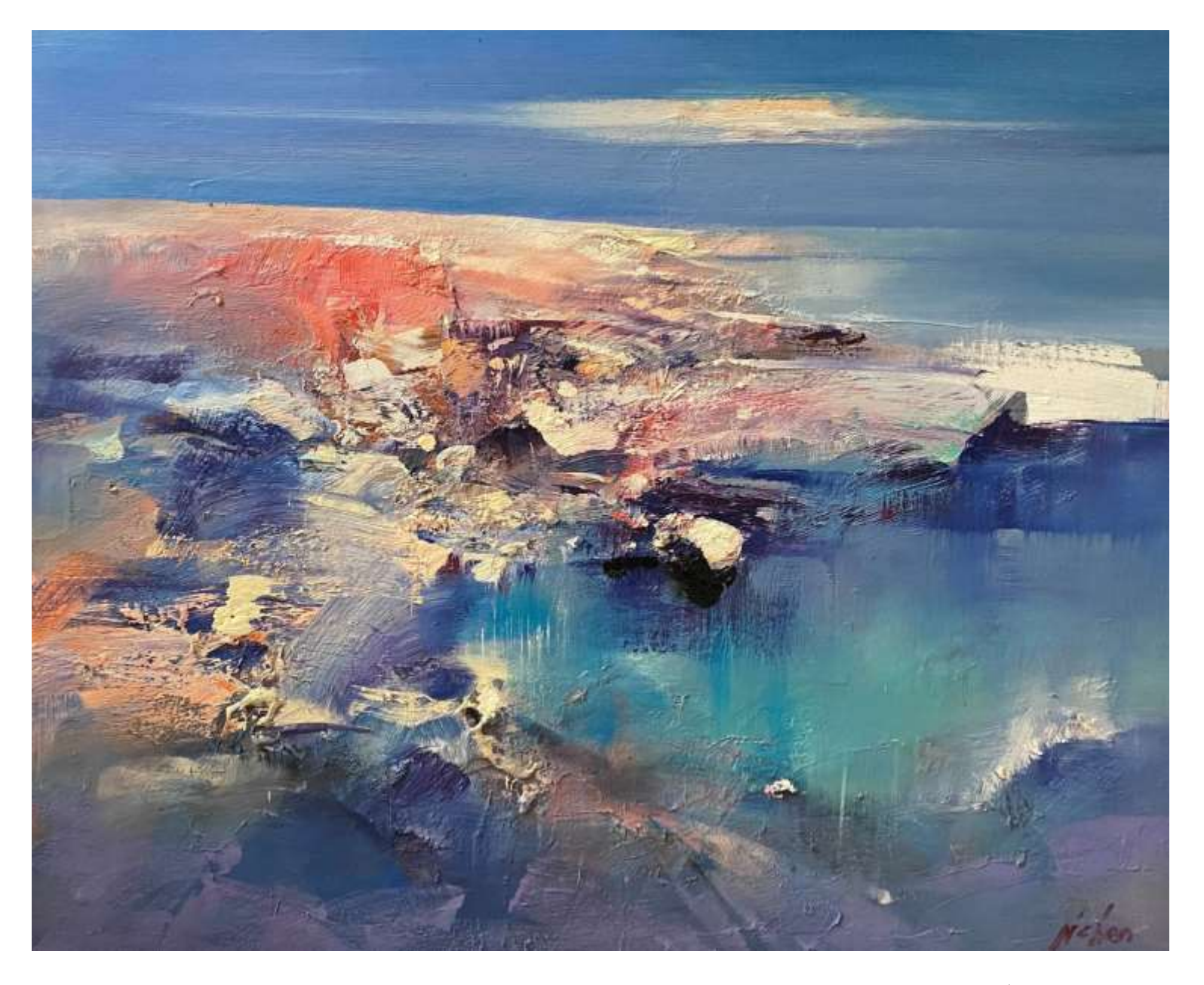
Ji Chen, Seaside meditation 2020 oil on canvas 70cm x 80cm $5,500