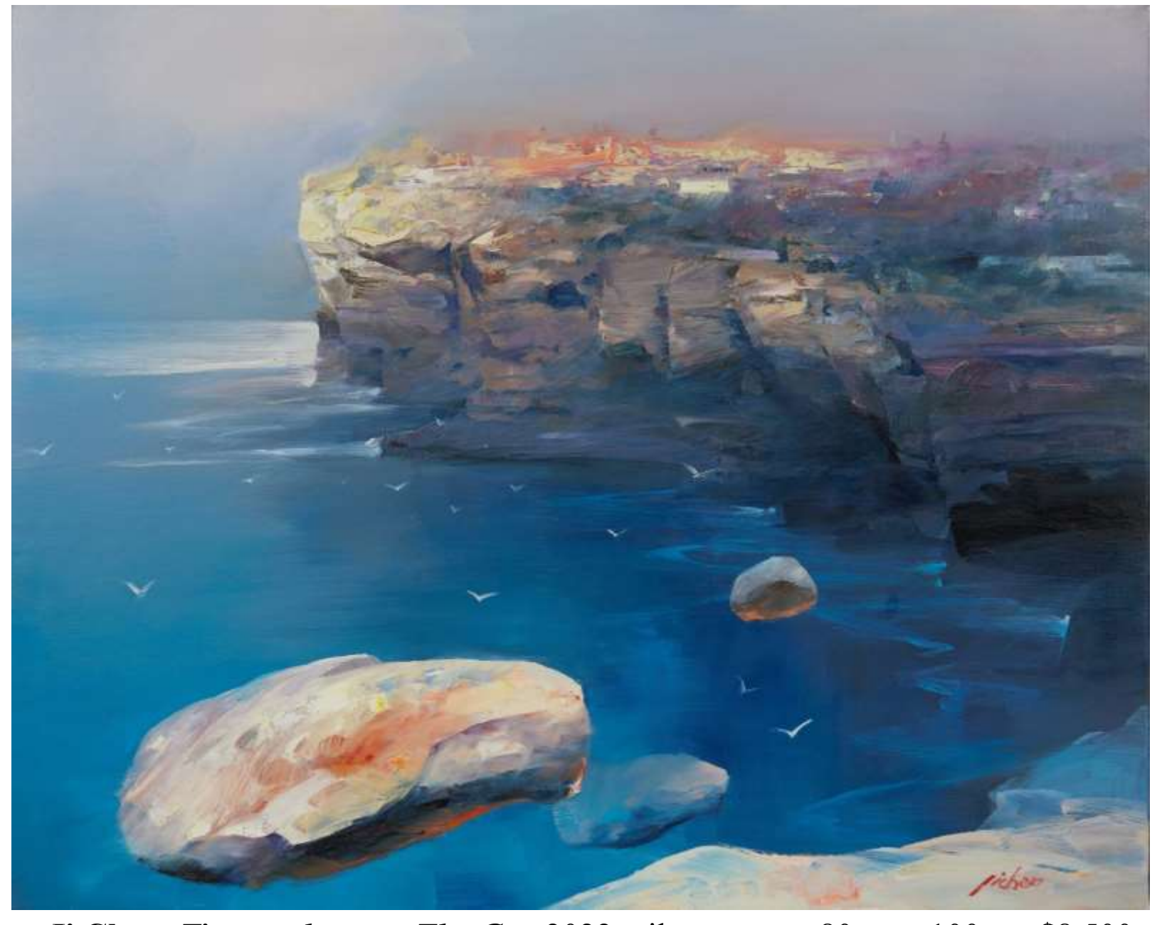
Ji Chen, Time and space, The Gap 2022 oil on canvas 80cm x 100 cm $8,500