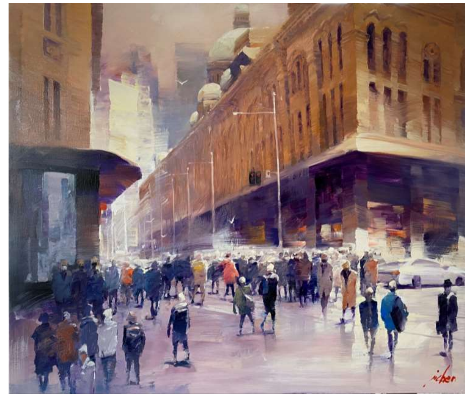
Ji Chen, George Street 2022 oil on canvas 100cm x 120cm $11,000