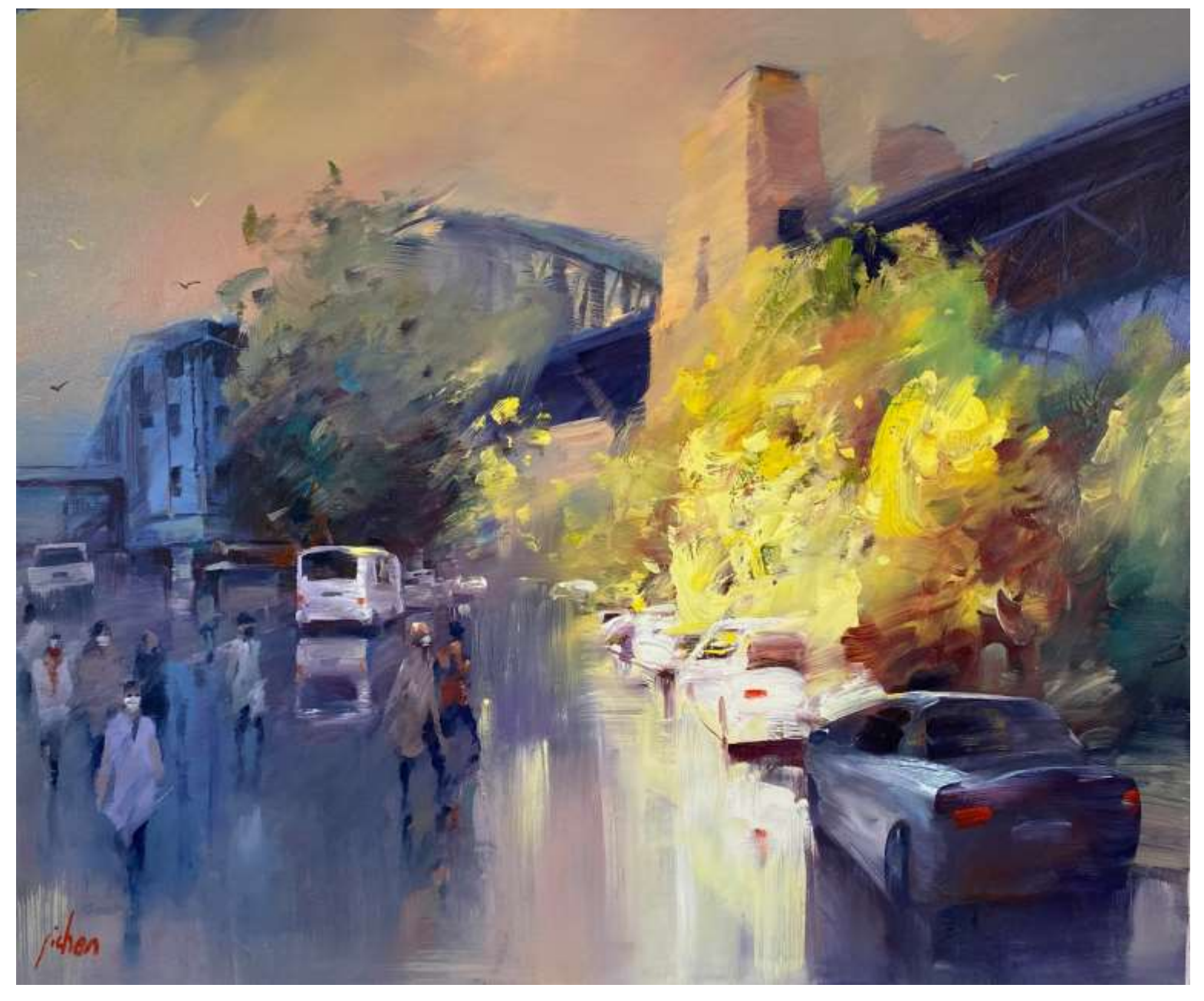
Ji Chen, Sydney Bridge II 2022 oil on canvas 100cm x 120cm $11,000