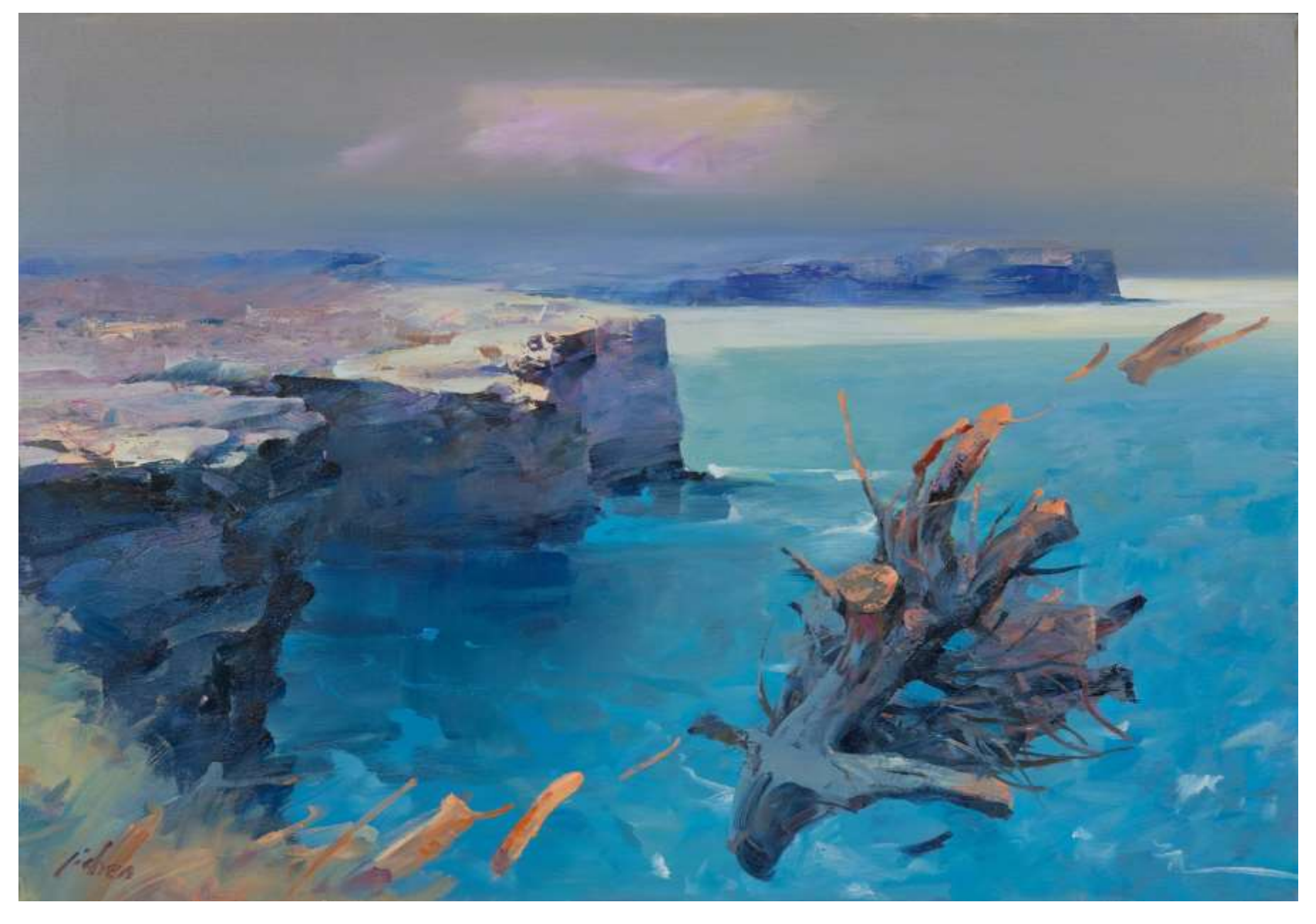
Ji Chen, Time and space, Watson Bay 2022 oil on canvas 80 cm x 100 cm $8,500