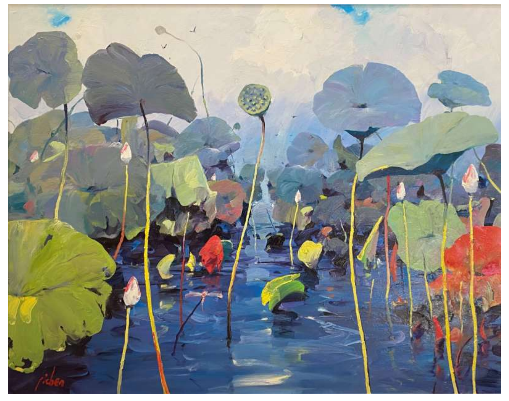
Ji Chen, Lotus Pond series II. 2023 oil on canvas 100cm x 120cm $11,500