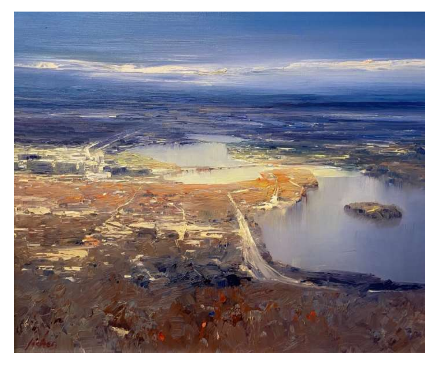
Ji Chen, View from Black Mountain, Canberra. 2019 oil on canvas 60 x 90 cm $5,500