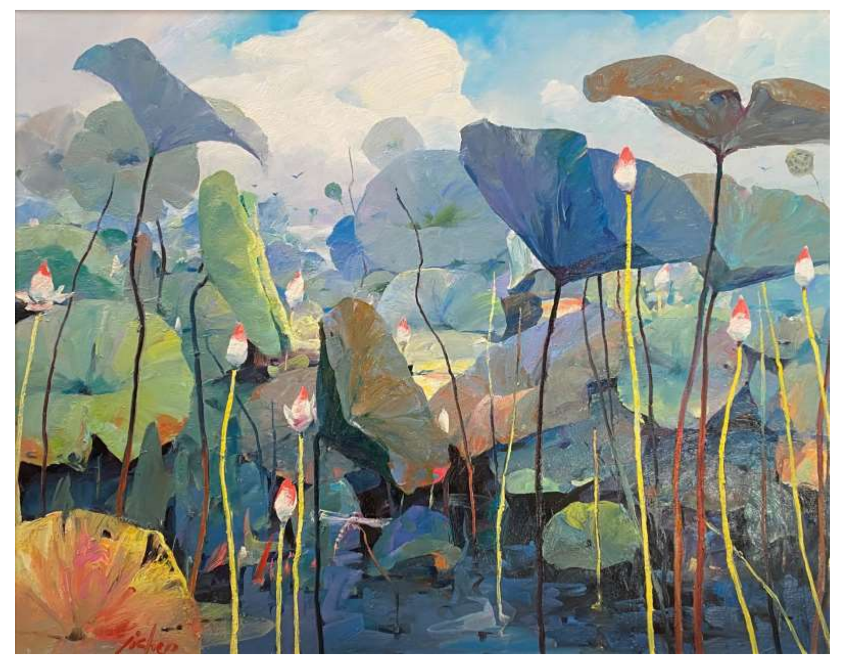
Ji Chen, Lotus Pond series IV. 2023 oil on canvas 100cm x 120cm $11,500