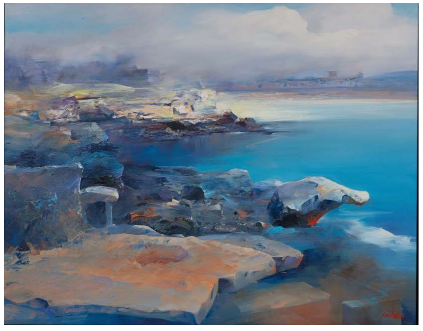
Ji Chen, Time and space, Bondi 2022 oil on canvas 90 cm x 110 cm $9,500