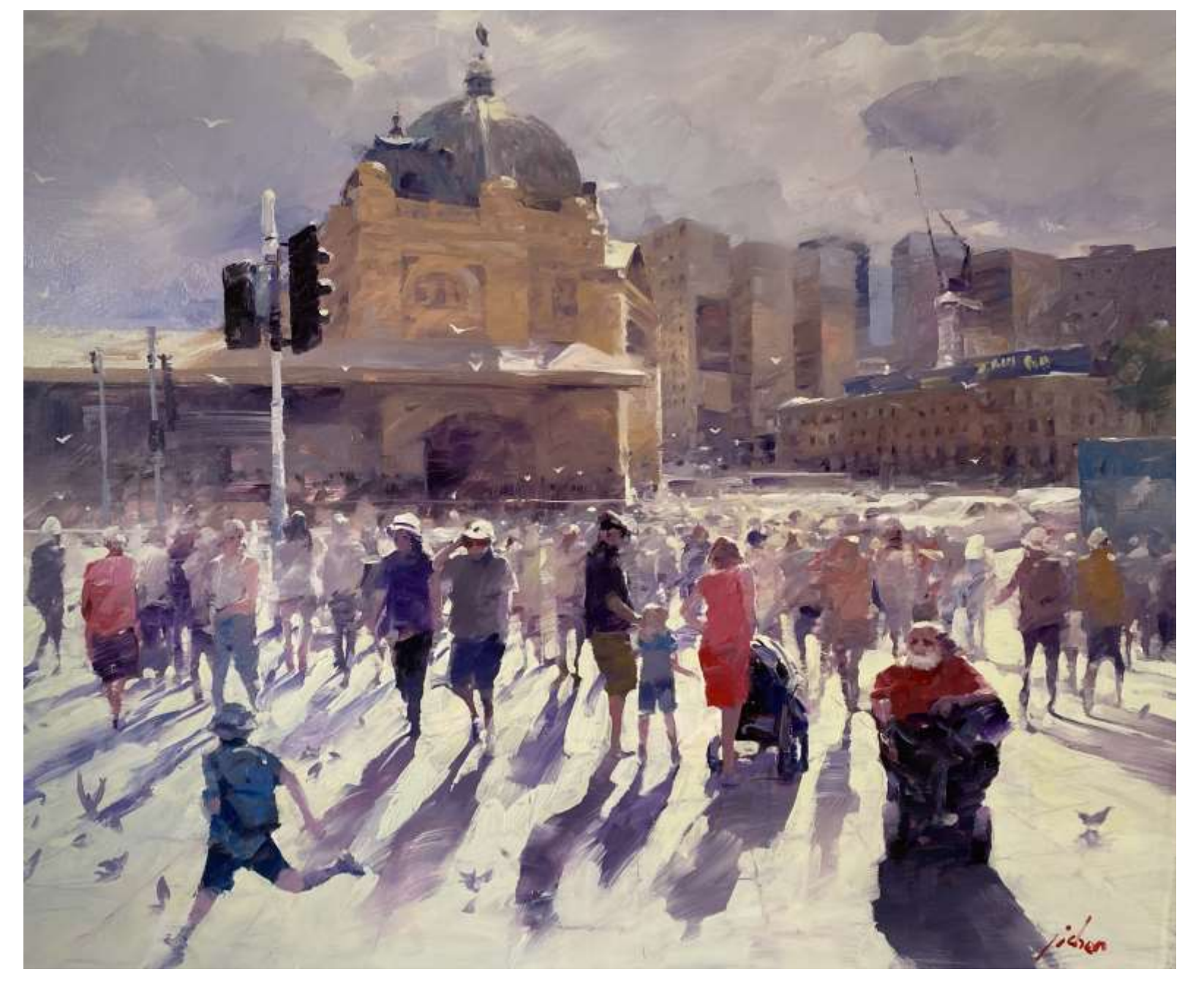
Ji Chen, Flinders Station 2022 oil on canvas 100cm x 120cm $11,000