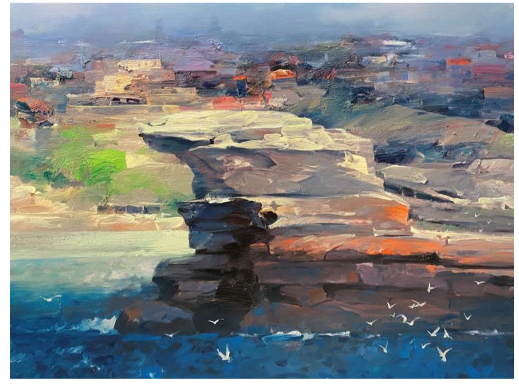
Ji Chen, In the sun 2020 oil on canvas 100 x 120 cm $11.000