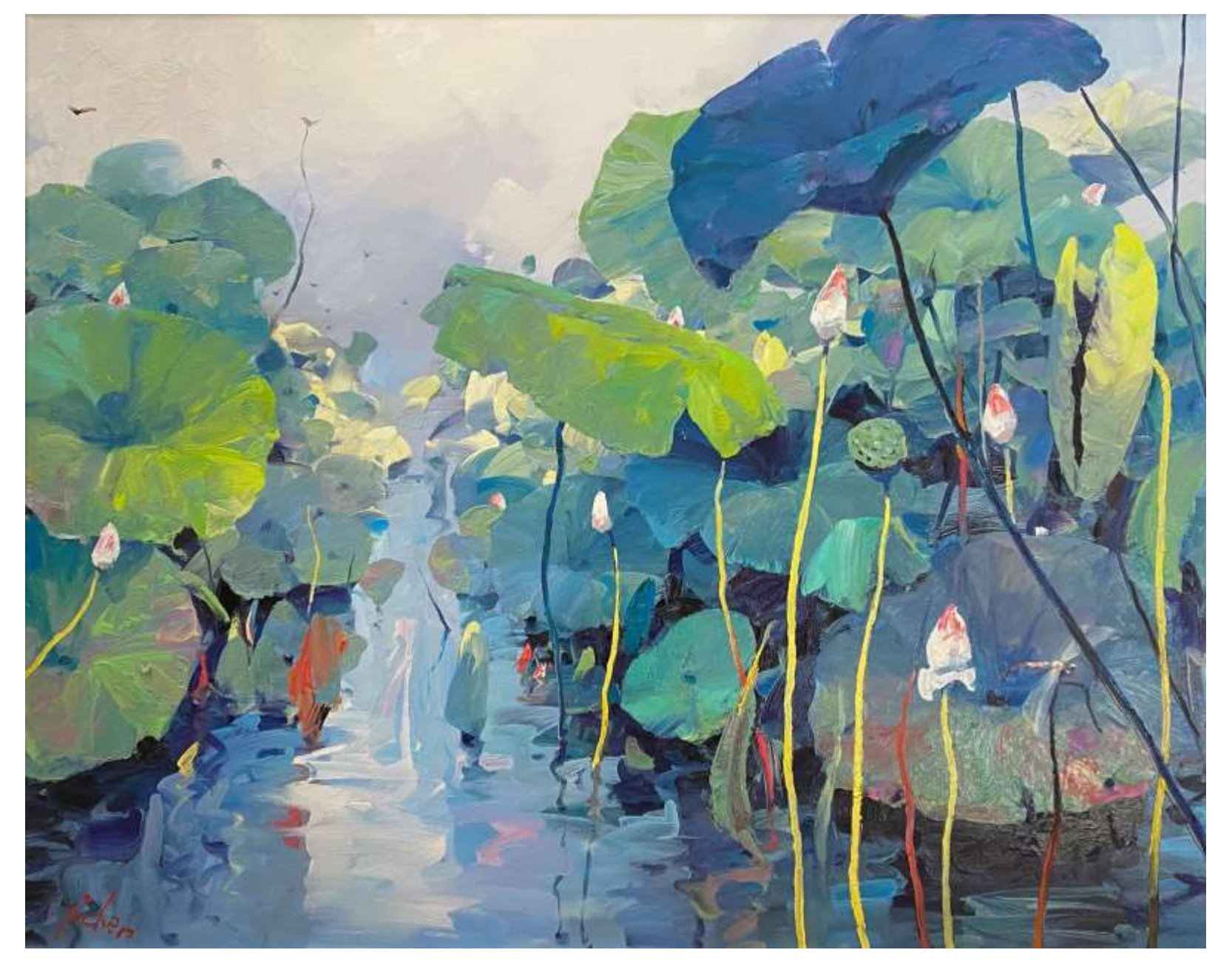
Ji Chen, Lotus Pond series III. 2023 oil on canvas 100cm x 120cm $11,500