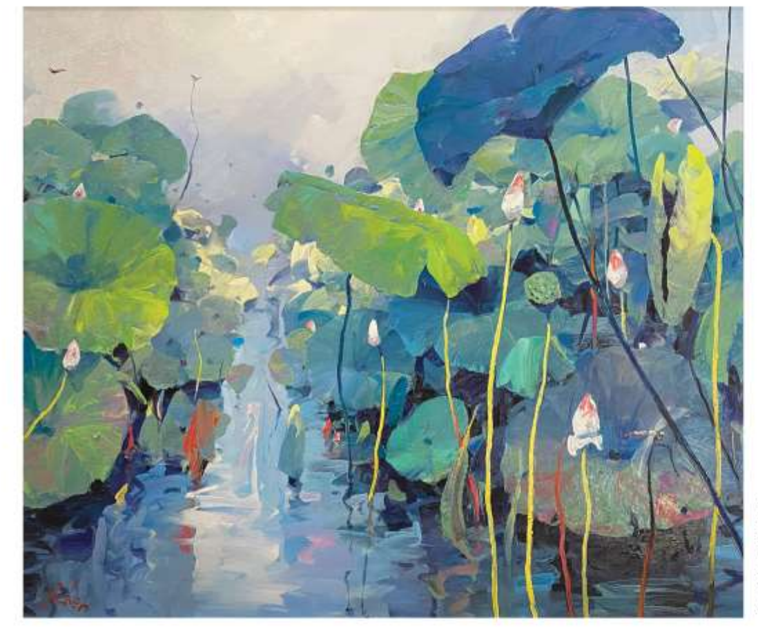
Ji Chen, Lotus series # 2, 2023, oil on canvas, 100 x 120 cm