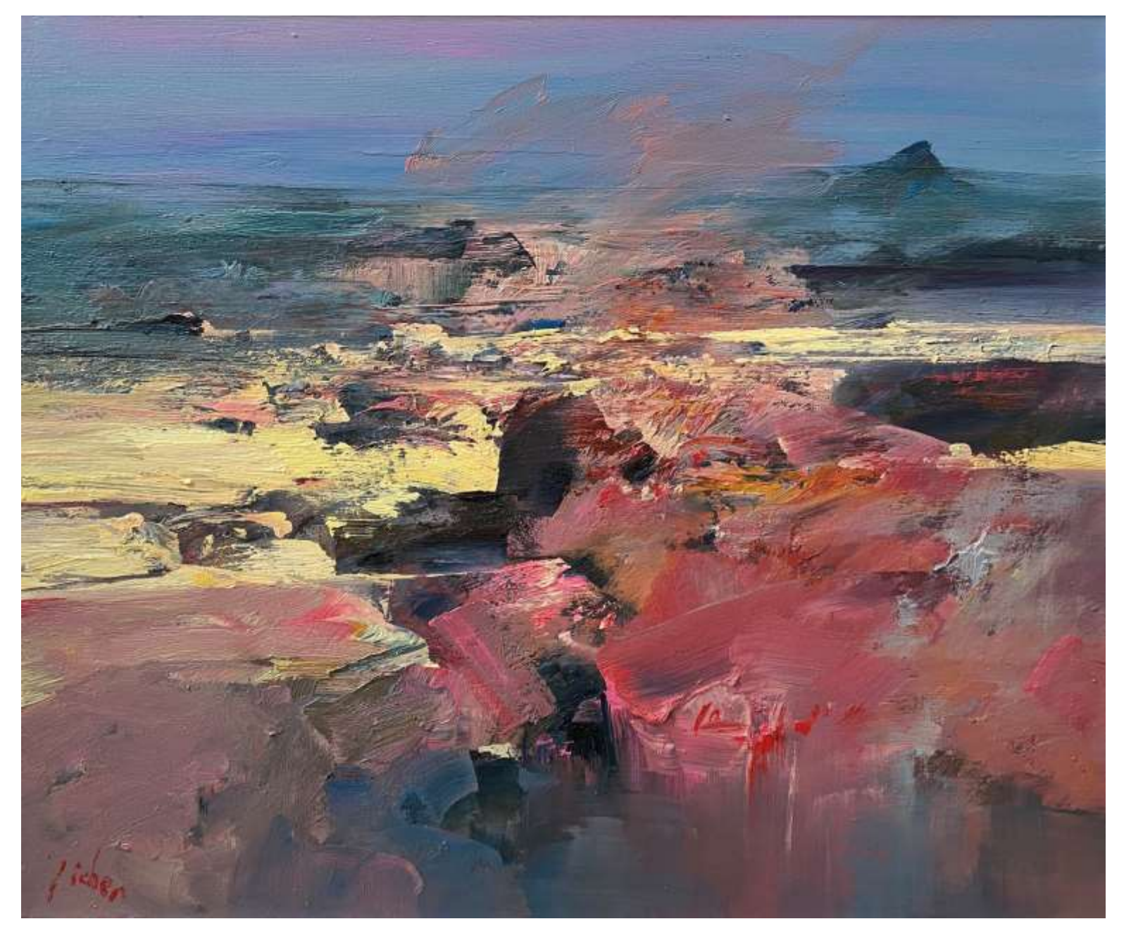
Ji Chen, Northern Desert 2022 oil on canvas 70 cm x 80 cm $5,500