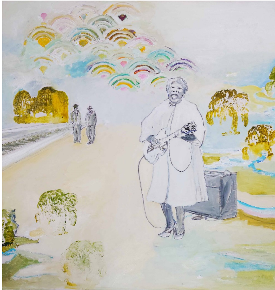
19. Sister Rosetta Tharpe , 2022 oil on canvas 50x50cm $600