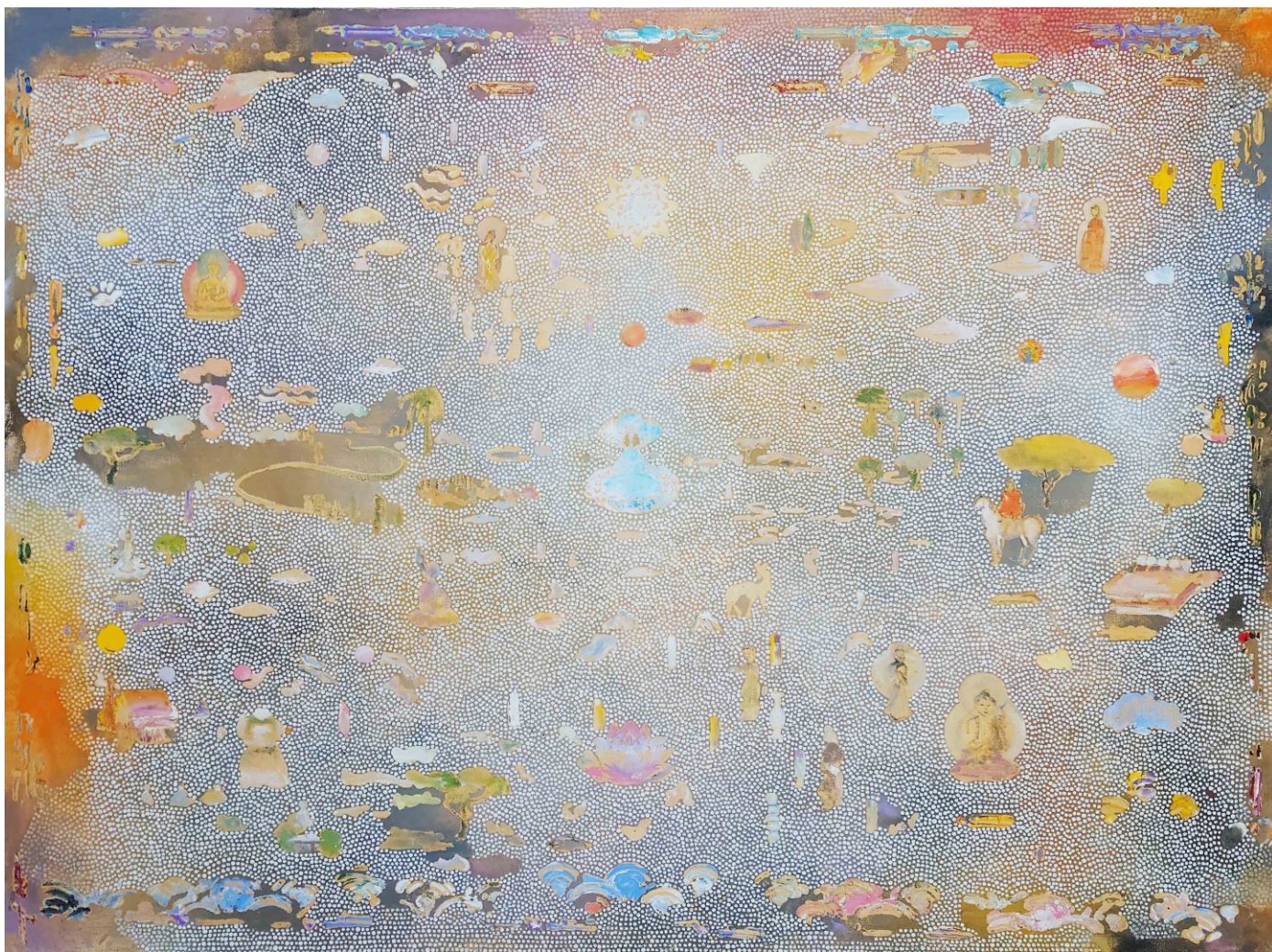
7. White Meru , 2022, acrylic on linen, 91x120cm $8,000