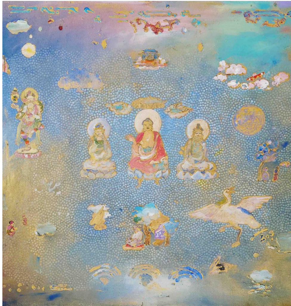
9. Medicine Buddha , 2022, acrylic on linen, 50x60cm $1,000 SOLD