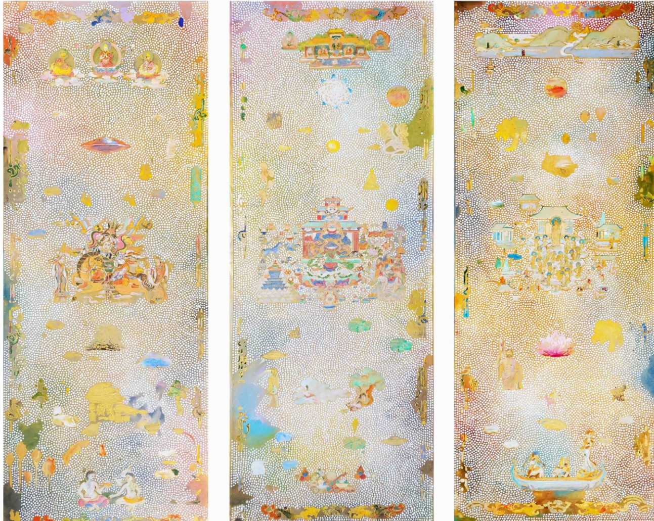
5. King Gesar , 2021 acrylic on linen, 3 panels, each 120x45cm, $9,000