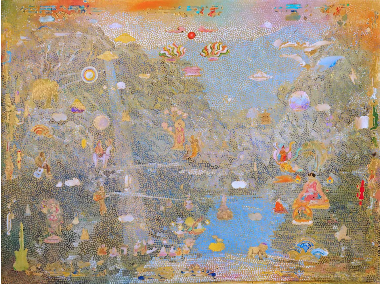
8. New Thredbo , 2022, acrylic on linen, 75x100cm $6,000