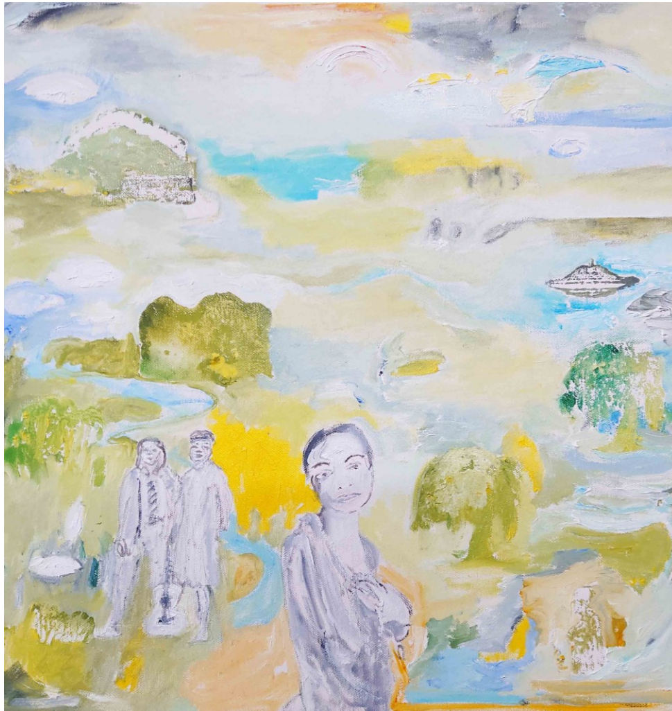
22. Bessie Smith, 2022 oil on canvas 50x50cm $600