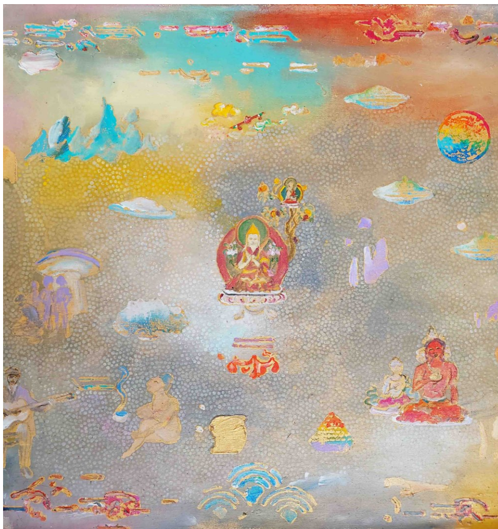
10. Tsong Kapa , 2022, acrylic on linen, 50x60cm $1,000