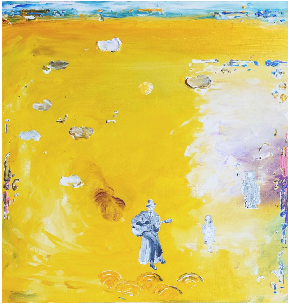
17. Robert Johnson, 2022 acrylic on canvas 50x50cm $600 SOLD