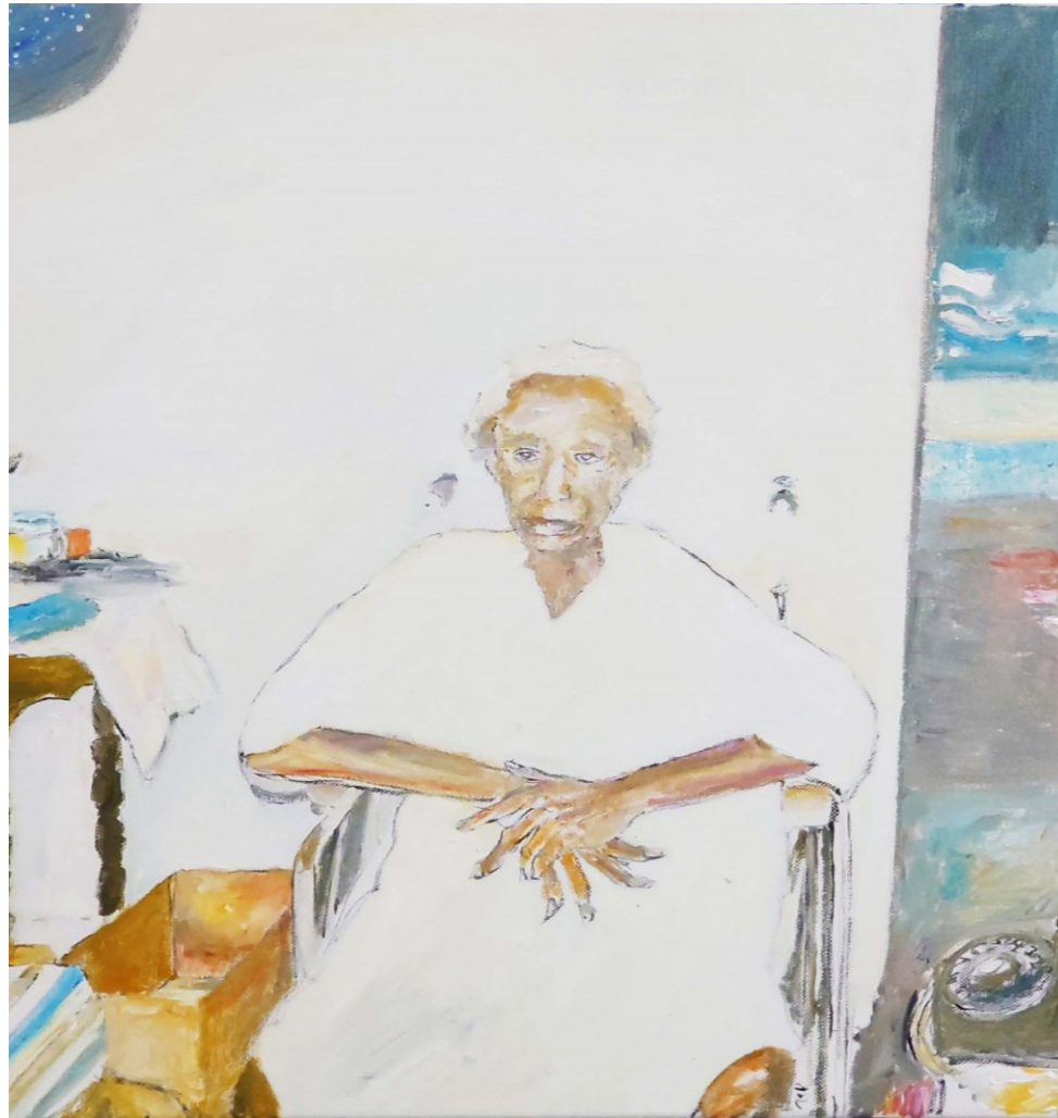
20. Elvie Thomas , 2022 oil on canvas, 50x50cm $600