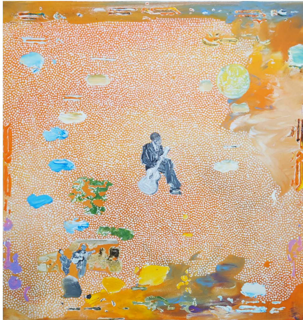
16. Lonnie Johnson, 2022 acrylic on canvas 50x50cm $600