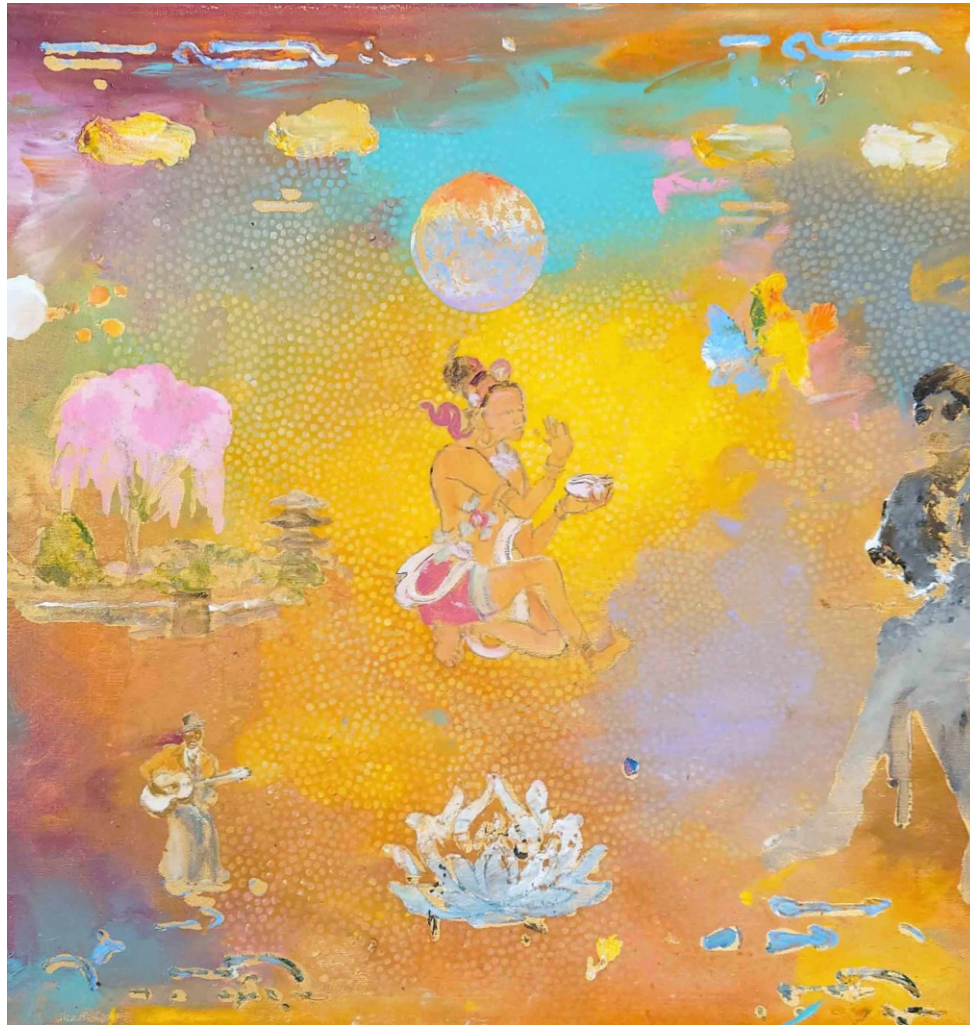
12. Arhat & Dylan , 2022 acrylic on linen, 40x50cm $800