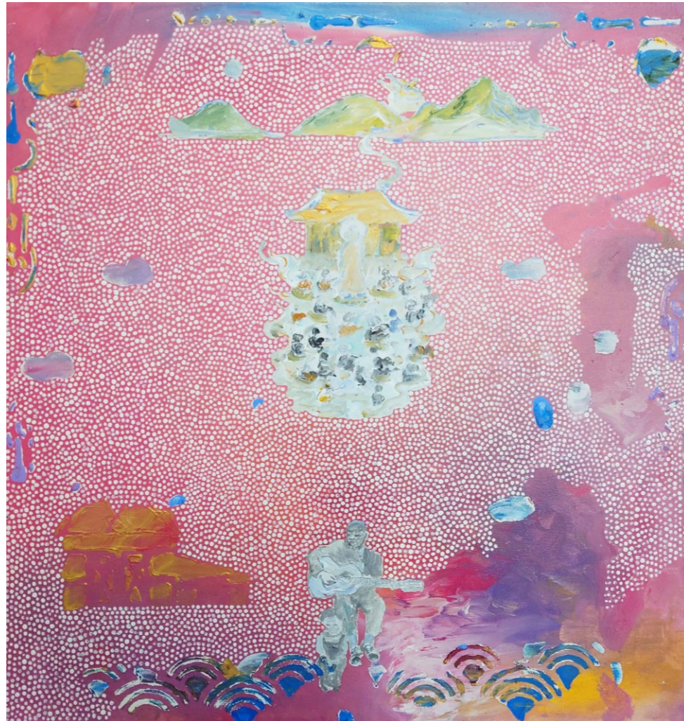
15 . House of Blues , 2022 acrylic on canvas, 50x50cm $600