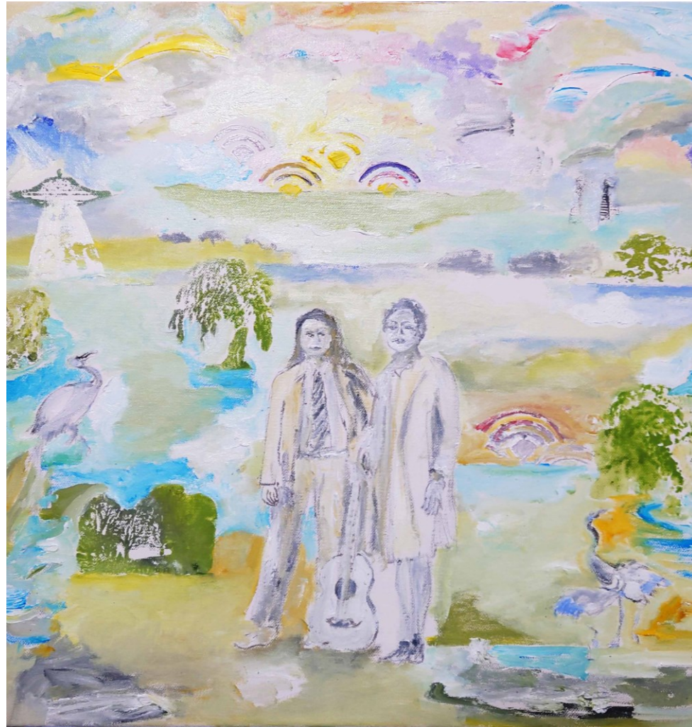
21. Geeshie Wiley and Elvie Thomas, 2022 oil on canvas 50x50cm $600