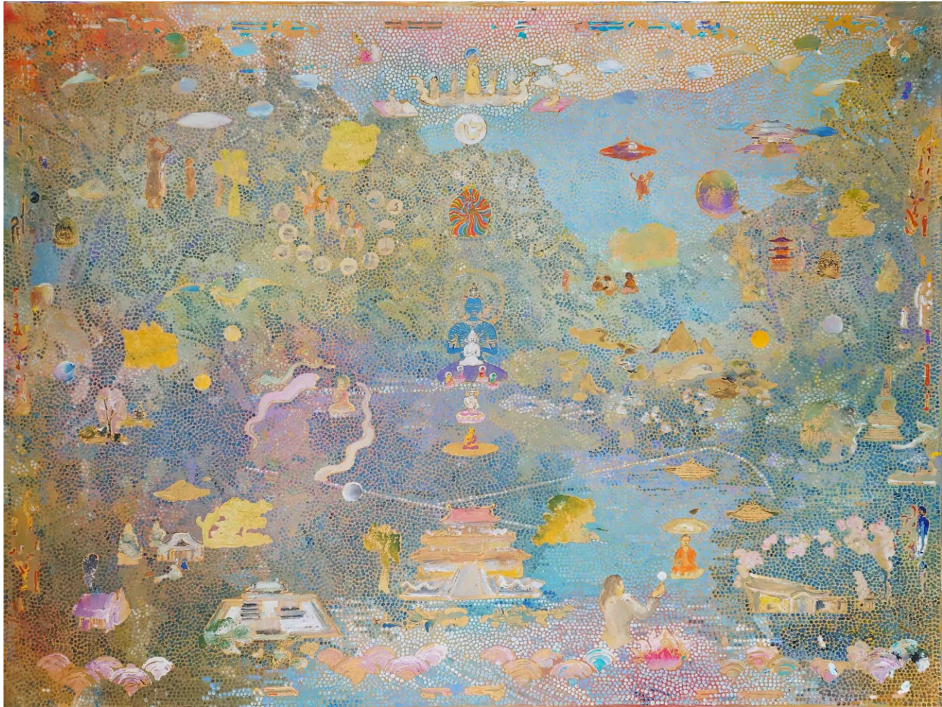
6. Buddha Within , 2022, acrylic on linen, 91x122cm $8,000