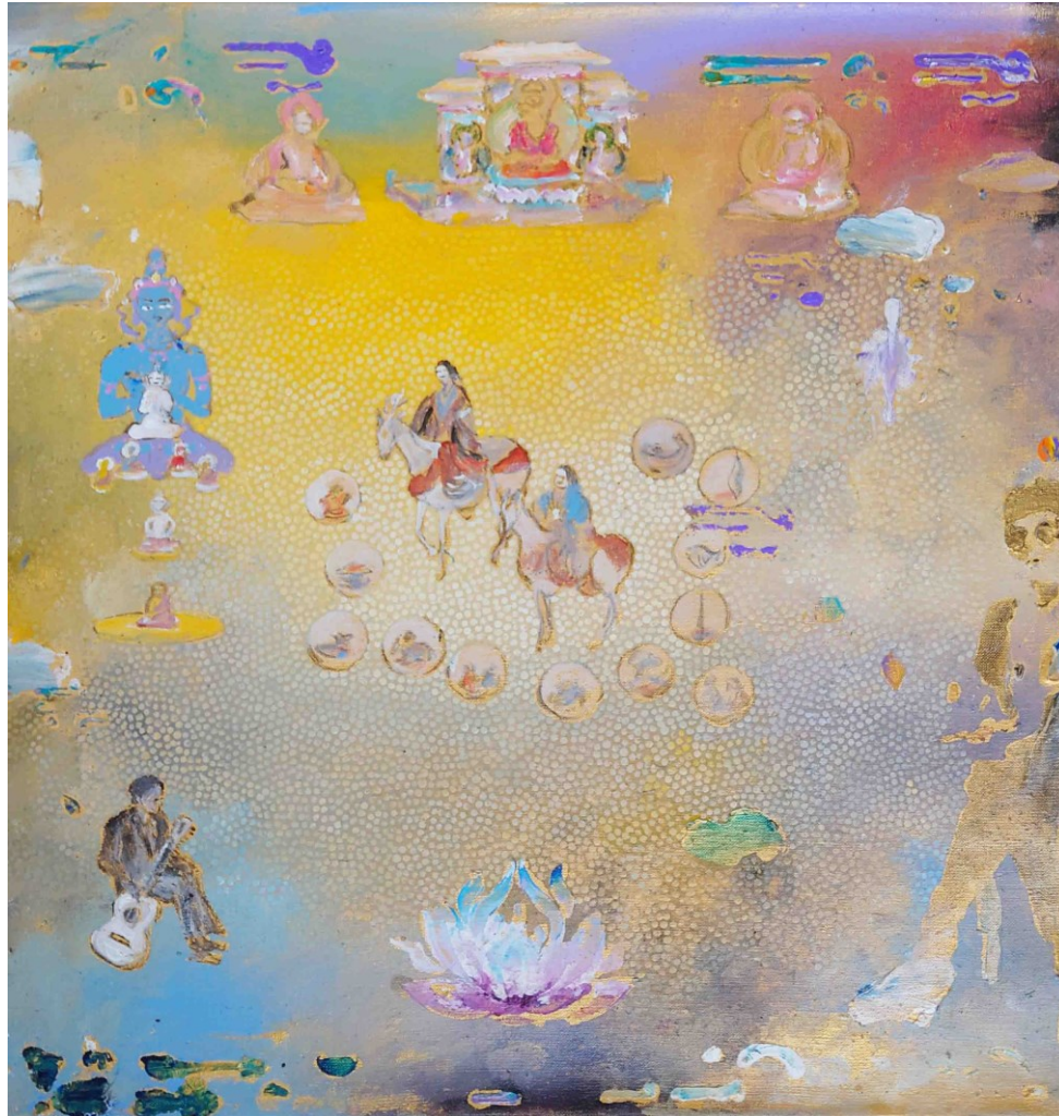
13. Two Riders , 2022 acrylic on linen, 40x50cm $800