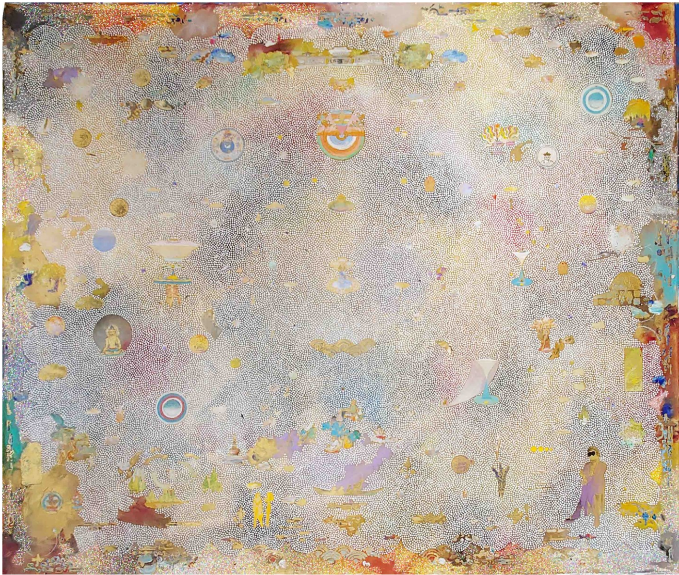
3. Cosmic Sea 2022 , acrylic on linen, 183x152cm $15,000