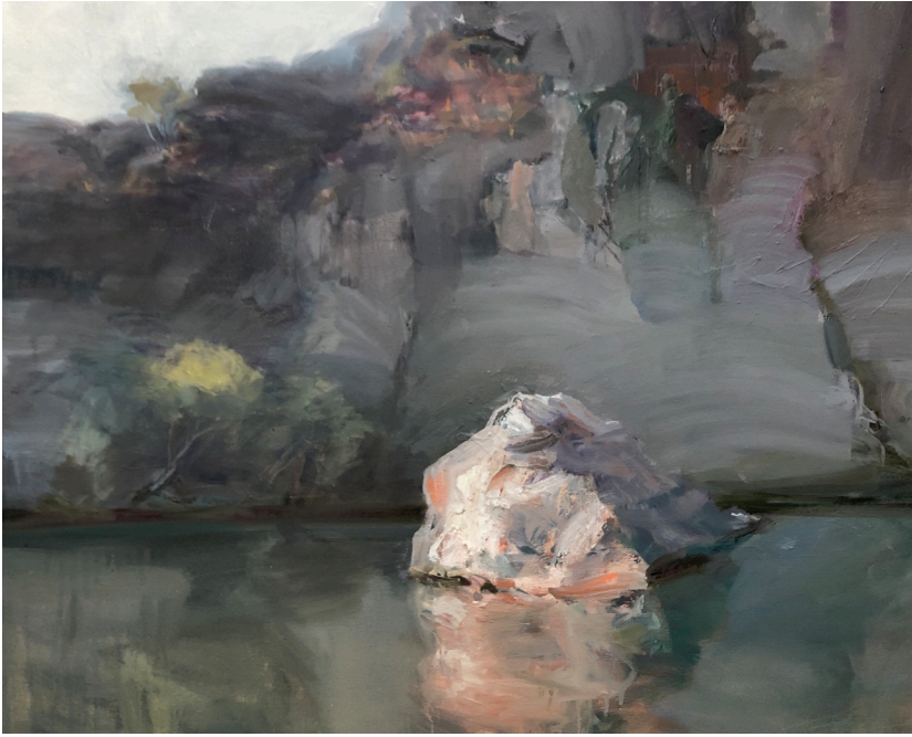
Kerry McInnis, Monolith 3 , 2021. Oil and oil stick on canvas, 61 x 77 cm $4,500