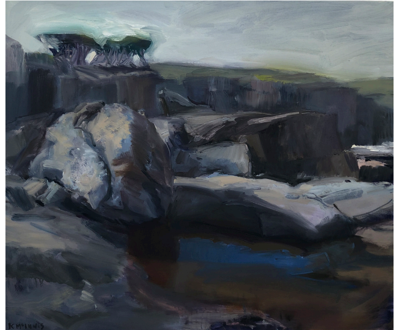
Kerry McInnis, Rock City , 2021. Oil and oil stick on canvas, 61 x 72 cm $4,500