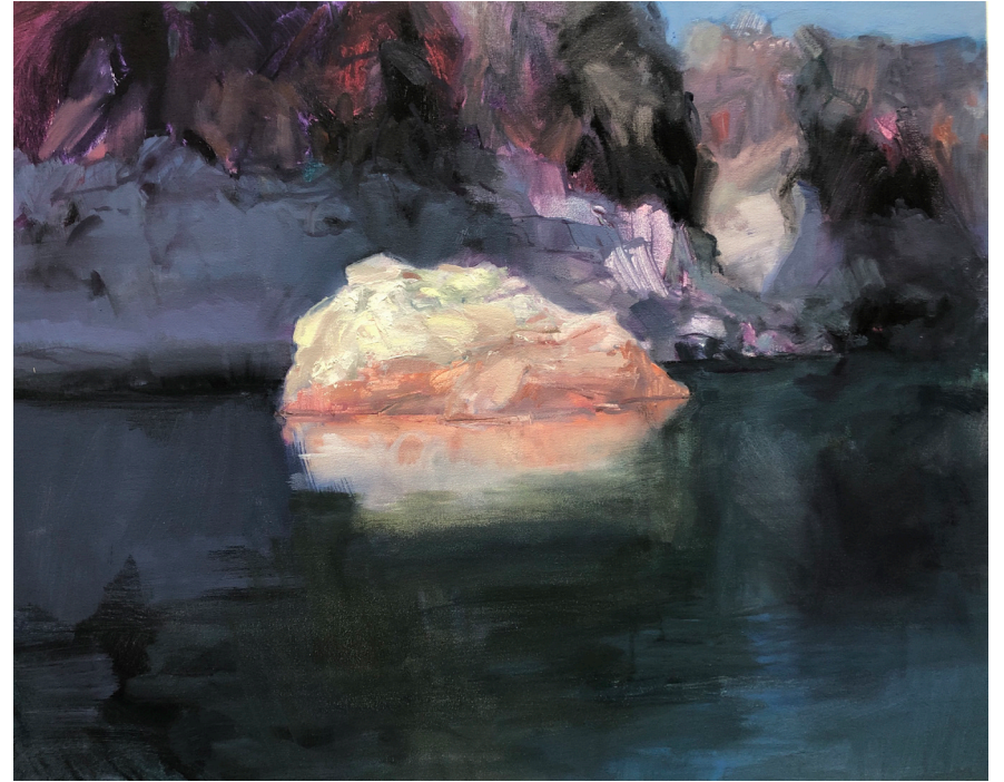
Kerry McInnis, Monolith 2 , 2021. Oil and oil stick on canvas, 61 x 77 cm $4,500