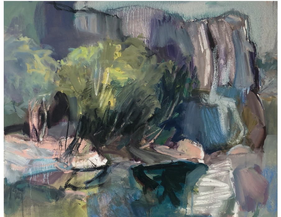
Kerry McInnis, Geike Cliff 2021. Oil and oil stick on canvas, 61 x 77 cm $4,500

Level 1, 131 City Walk, Civic (Next door to King O'Malley's) Canberra City ACT 2601 T: +61-6262 8448 M: 0416 249 102 Instagram: @nancysevergallery