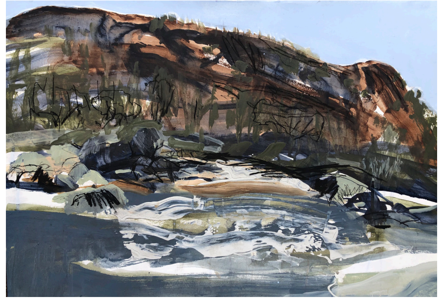
Kerry McInnis, Snowy River . 2021 Mixed media on paper, (acrylic conte and charcoal). Image: 41 x 60 cm, framed: 65 x 80 cm $3,000