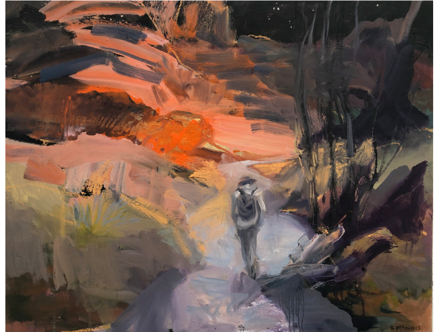
Kerry McInnis, Night walker , 2021. Oil and oil stick on canvas, 61 x 77 cm $4,500