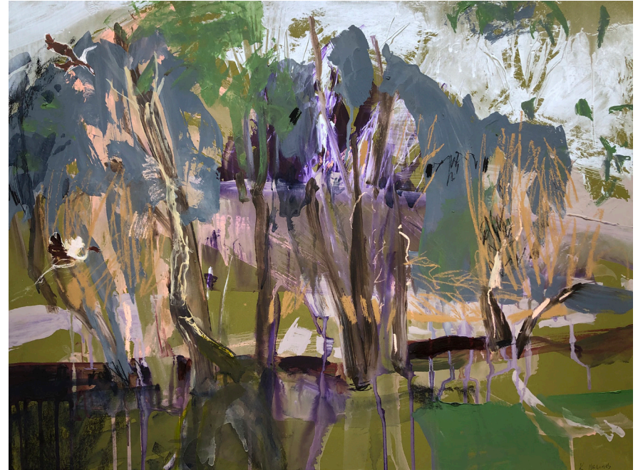
Kerry McInnis, Fitzroy , 2021 Mixed media on paper, (acrylic, conte and charcoal). Image: 48 x 63 cm, framed: 71 x 87 cm $3,000