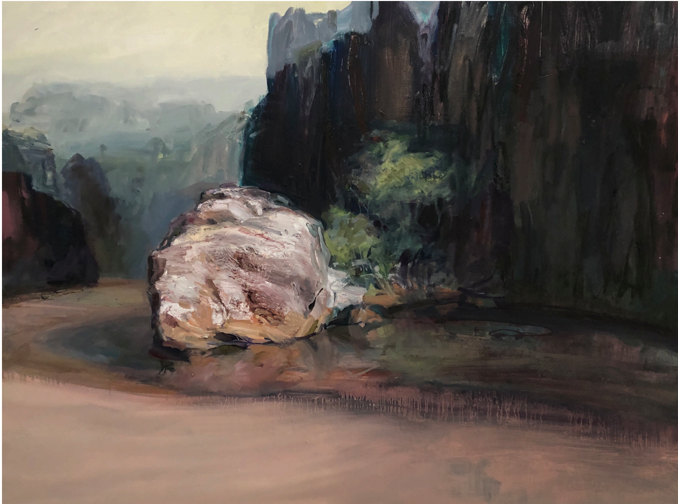
Kerry McInnis, Monolith 4 , 2021. Oil and oil stick on canvas, 92 x 122 cm $8,800