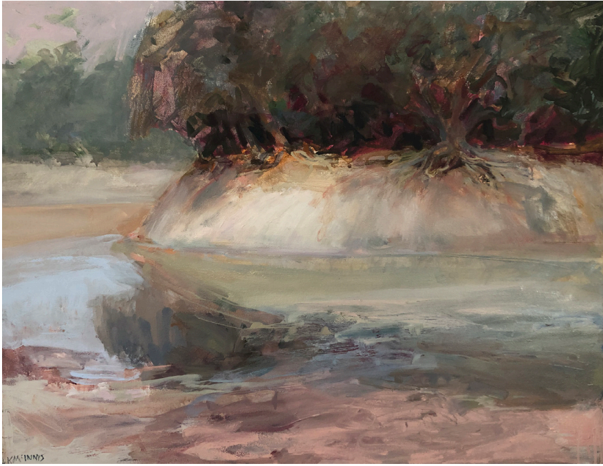
Kerry McInnis, Darling River , 2021. Oil and oil stick on canvas, 61 x 77 cm $4,500