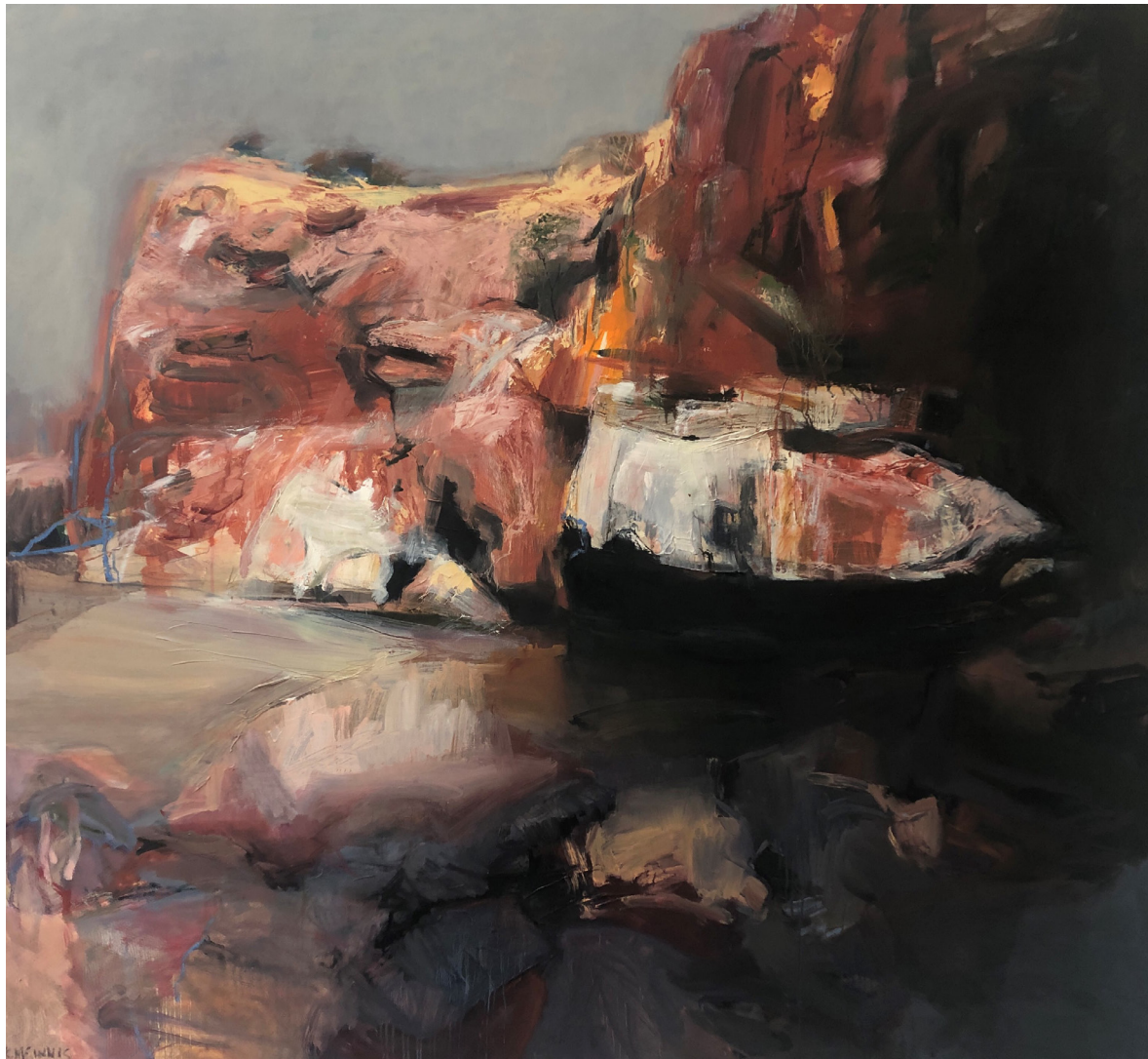
Kerry McInnis, The Gorge Cliff , 2019. Oil and oil stick on canvas, 152 x 168 cm $16,000