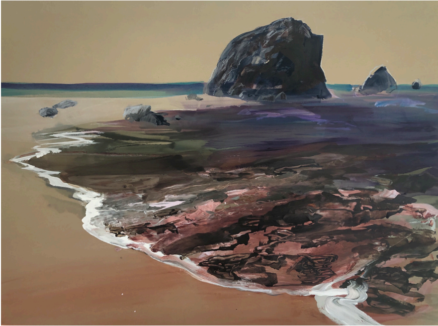
Kerry McInnis, Dark rocks , 2021 Mixed media on paper, (acrylic conte and charcoal). Image: 52 x 71 cm, framed: 78 x 93 cm $3,000