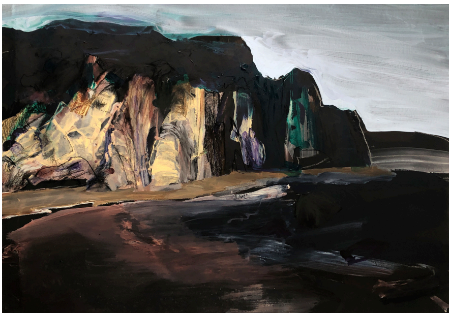
Kerry McInnis, Coastal Headland , 2021 Mixed media on paper, (acrylic, conte and charcoal). Image: 47 x 67 cm, framed: 63 x 83 cm $3,000