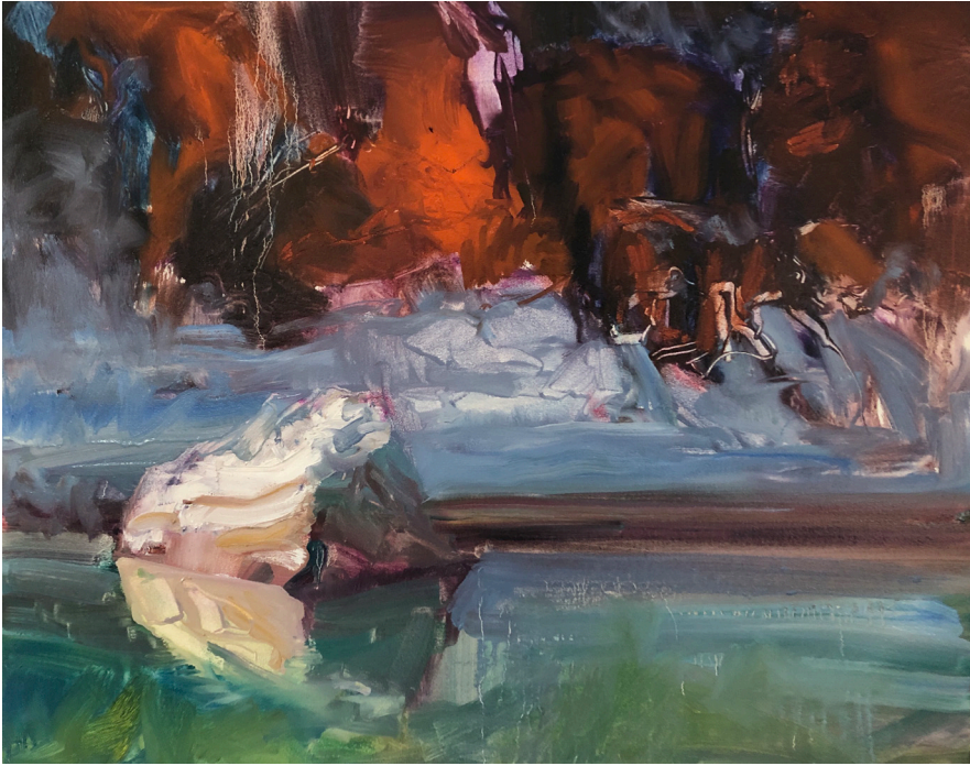
Kerry McInnis, Monolith 1 , 2021. Oil and oil stick on canvas, 61 x 77 cm $4,500