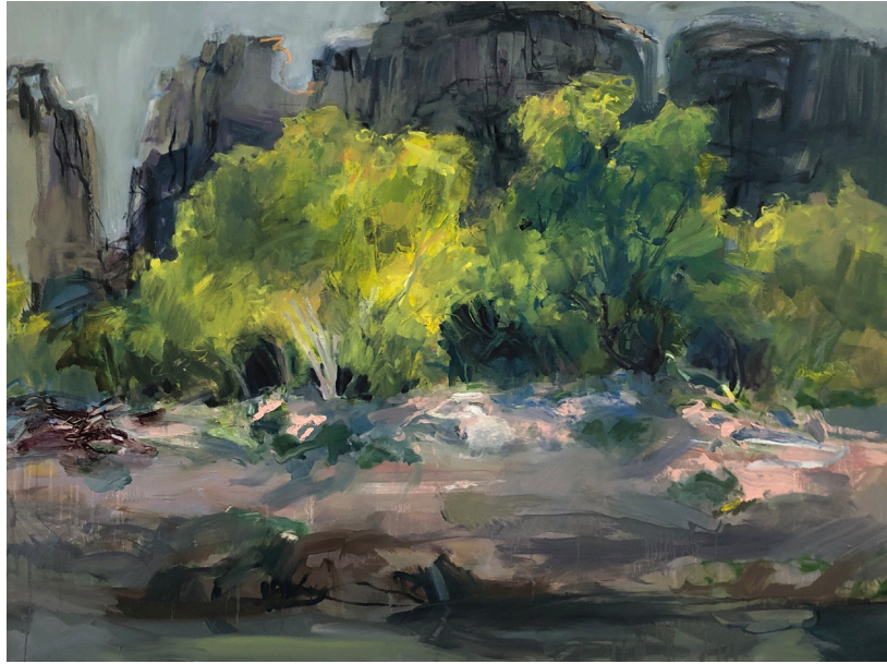
Kerry McInnis, Geike backlight . 2021. Oil and oil stick on canvas. 92 x 122 cm