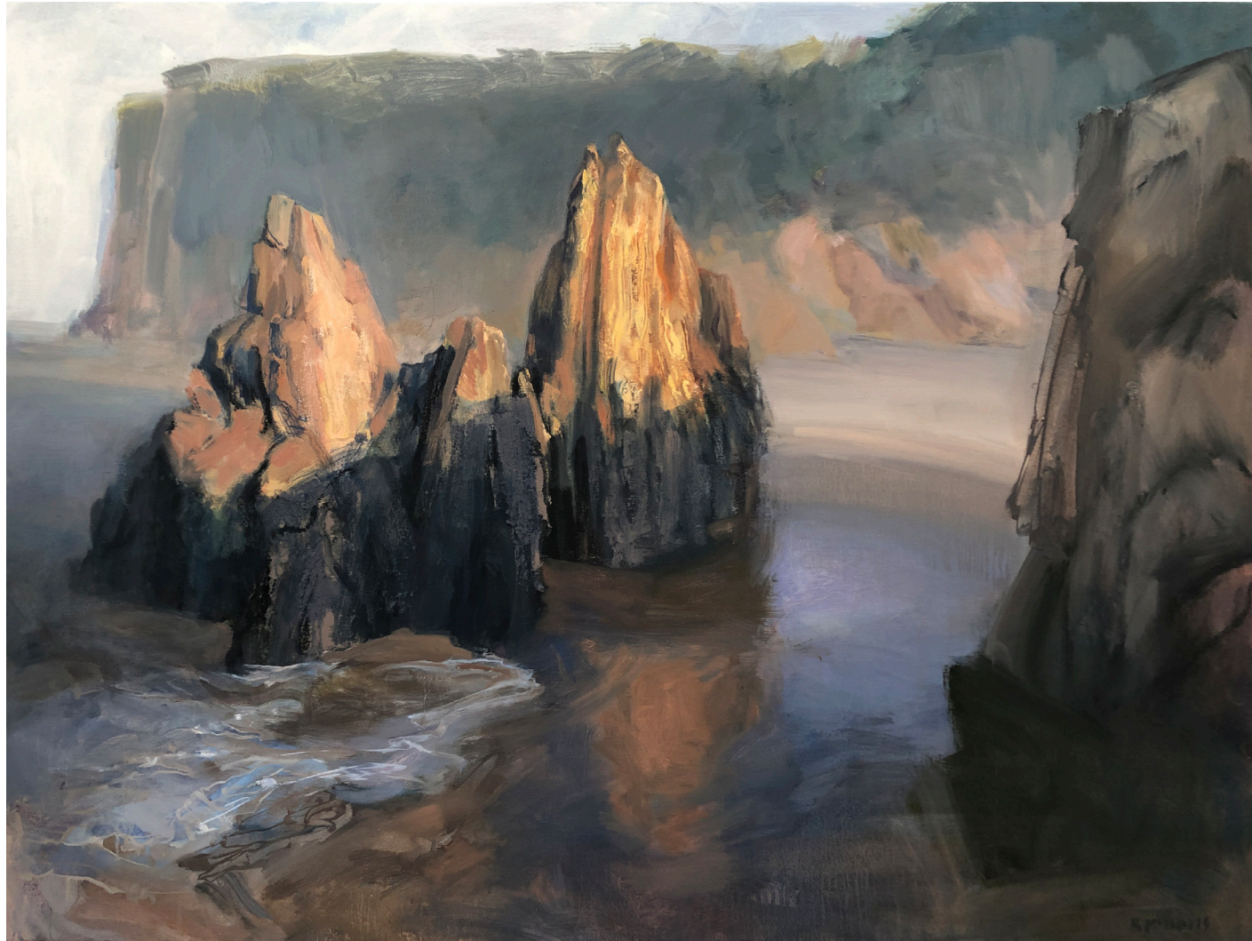
Kerry McInnis, Sea stone , 2021. Oil and oil stick on canvas, 92 x 122 cm $8,800